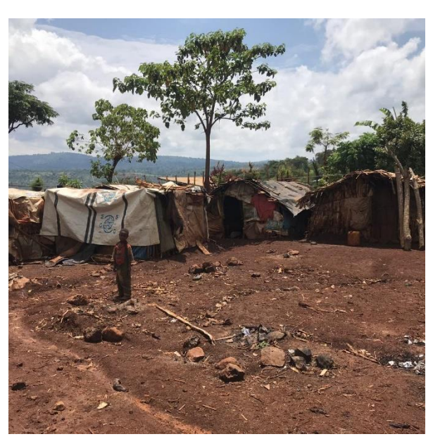
Figure 1 Empty IDP site in kercha town.

Similarly, the West Guji DRMO reported that over 11,000 IDPs have returned from Kercha collective sites to their respective homes in rural kebeles as of 03 May 2019. On 06 May, seven buses were deployed to move the first