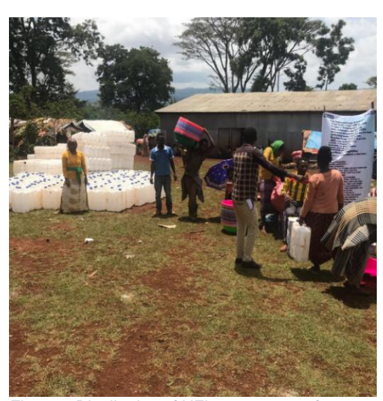
Figure 2 Distribution of NFIs to returnees from Gedeb and Kercha woreda.

It is to be recalled that, on 8 April 2019, the Government of Ethiopia, through the Ministry of Peace (MoP) and the National Disaster Risk Management Commission (NDRMC) presented a Strategic Plan to Address Internal Displacement in Ethiopia and a costed Recovery/Rehabilitation Plan to donors and international agencies