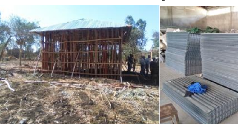
Figure 2 Reconstruction of houses to IDPs in Amhara region. Photo Credit: RDPFSP/ANSSCC, May 2019

So far, the Government returned 12,680 IDPs to their places of origin and reconstructed 629 houses in West Dembia, East Dembia, Chilga 1, Chilga 2 and Lay Armacho woredas of Central Gonder zone. In parallel, the Government is working on peacebuilding and reconciliation activities at regional, zone, woreda and kebele levels. The regional Government has called for humanitarian and development partners to do more in supporting the IDP durable solution initiatives in Amhara region.