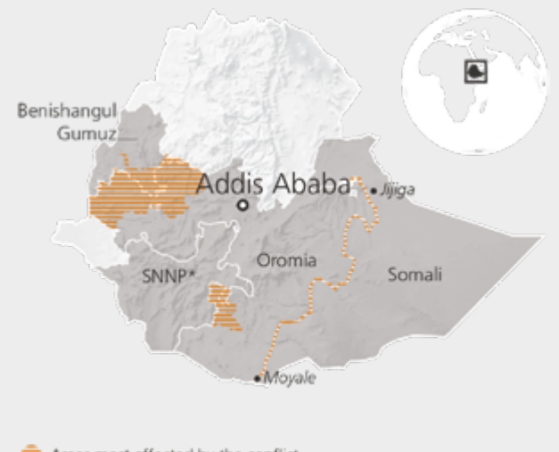
Areas most affected by the conflict *Southern Nations, Nationalities, and Peoples Region

After two decades of relative calm, the most significant displacement was triggered by inter-communal violence between the Guji and Gedeo ethnic groups that erupted in April and again in June in the West Guji zone of Oromia and the Gedeo zone of SNNP. Underlying ethnic tensions were aggravated by competition for land and scarce resources.<sup>40</sup> The conflict left hundreds of thousands of people sheltering in overcrowded collective centres, where humanitarian agencies struggled to provide food, health, water and sanitation for the rapidly growing displaced population. The government collaborated with the agencies, who had no previous