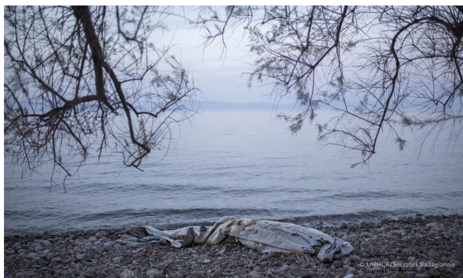
The remains of a rubber dinghy used by refugees and migrants to cross from Turkey to Greece

4 Field Units in Evros, Ioannina, Leros, Rhodes