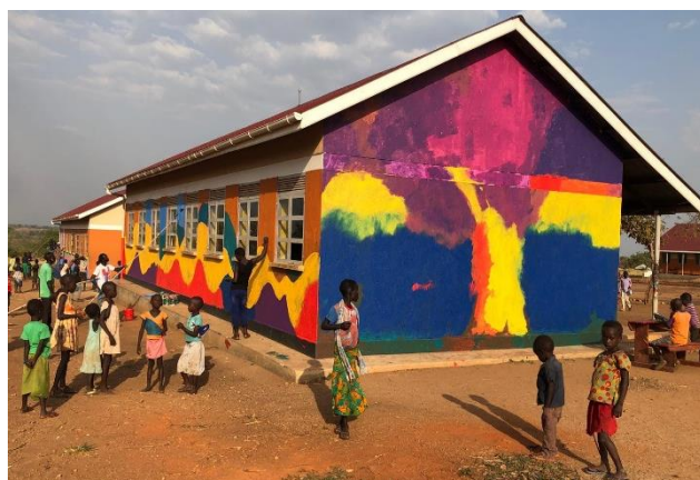
School block painting in progress in Bidibidi settlement ©M.Fielder Artolution