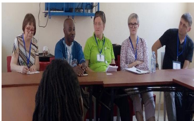
The Head of UNHCR Sub-Office Yumbe discussing education related challenges of Bidibidi with Finnish Vicars visiting FCA projects.