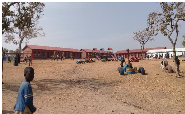
one of the newly constructed classroom blocks at Happy ECD centre in zone 3