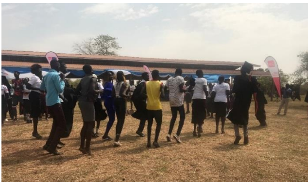
South Sudanese Refugee graduands joining the Ugandan entertainment group

metal fabrication, building and construction, tailoring and garment designs, agriculture, electrical and electronics, computer application and carpentry/ joinery. The ceremony was officiated by the Guest of Honour, Honorable Bwayo Rogers, Chief Administrative Officer (CAO) for Adjumani, on behalf of the Minister of Education and was attended by UNHCR, partners, district authorities and OPM. The event was marked with presentations of music by various entertainment groups from Northern Uganda.