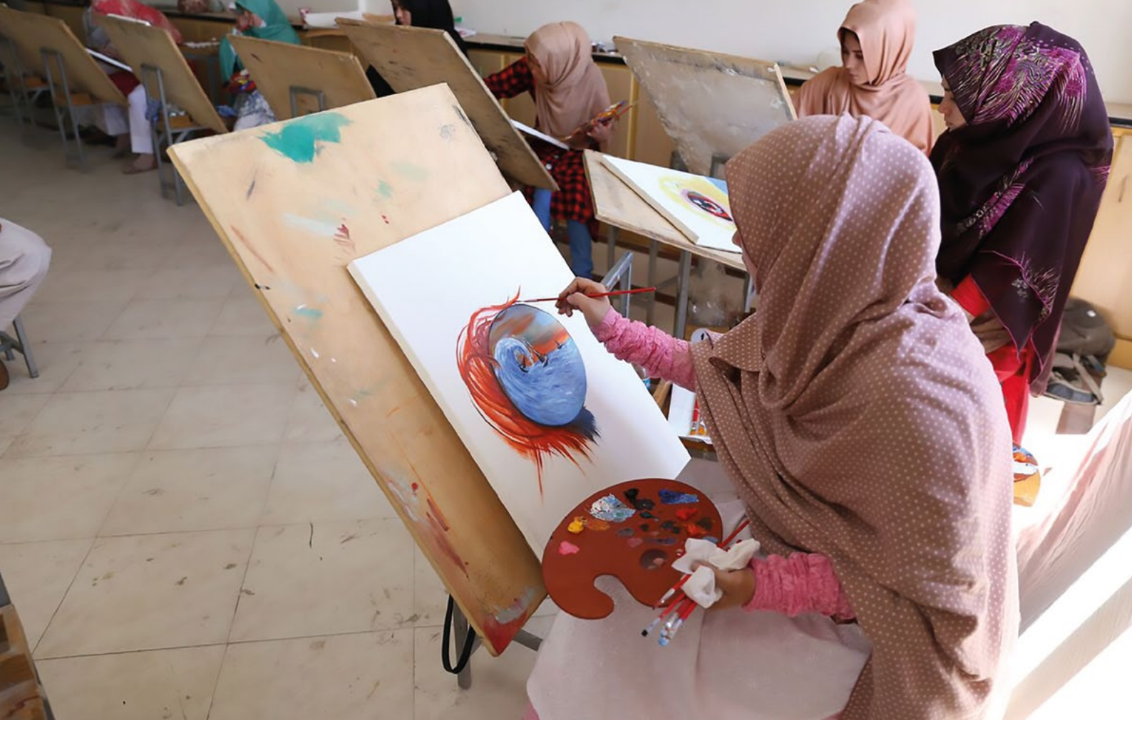
Afghan and Pakistani youth participating in a 2017 World Refugee Day painting contest.