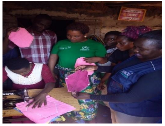
Women groups making re-useable sanitary pads in Kyangwali