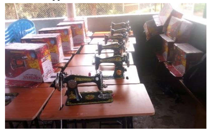
Newly assembled sewing machines procured for MHM activities.

UNHCR and partners in Arua adopted Standard Operating Procedures (SOPs) for the management of the Protection Houses of Arua and Koboko Districts, including the newly launched Protection House of Imvepi, built with CARE funds and inaugurated on 20th December 2018. The interagency SOPs constitute an essential instrument to operationalize the existing Houses and any others that might come up, ensuring that each of the partners in charge of managing these facilities will adopt a uniform approach in the provision of the highest standard of protection delivery. The SOP is particular on having protection houses as a last resort after all community-based mechanisms have been explored.