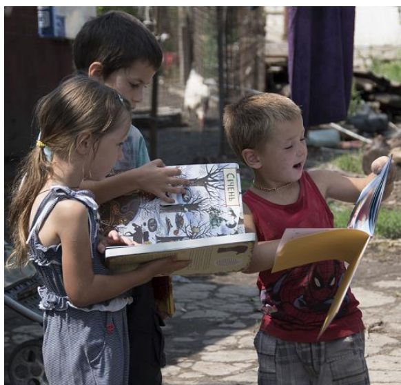
A family of 7 children from the village of Troitske, situated along the Contact Line, received a cash grant from UNHCR and books from Partner NGO Proliska.