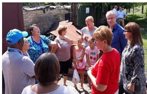
UNHCR took Minister to the village of Kurdiuivka. In this village, UNHCR and implementing partners rehabilitated 38 homes. Despite absence of military in the city, it suffered various shelling incidents in early 2015, early 2017 and recently in early 2018. As a result, people were killed and buildings destroyed. In response, UNHCR not only repaired 38 homes but also coordinated other partners through its Shelter Cluster to repair and provided in-kind material donations to a total of 83 households. Before, the village survived thanks to a ceramic factory. However, the factory was destroyed early in the conflict leaving the residents with no livelihood.