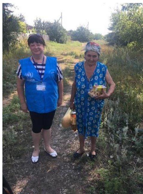
UNHCR through its Partner Proliska is the only organisation that has access to the village of Spirne, situated some 30 km from the Contact Line. Only elderly people stayed in the settlement, deprived of all services, namely food, medicine, transportation, gas and central heating. UNHCR is providing them with essential humanitarian and protection aid.