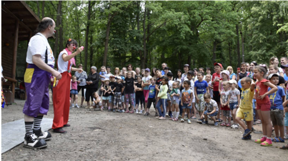
On 17 June, UNHCR organized World Refugee Day celebration in Kharkiv jointly with partners Station Kharkiv, AKCentre, and R2P. The event took place at Feldman Eco Park and included a “Clowns without Borders” performance, games, workshops, and a horse-show. The event gathered around 200-250 children from the local, displaced and refugee communities, as well as their parents.

As of 11 June and for a period of three weeks (11 to 27 June), UNHCR Ukraine counted on the support of Clowns without Borders Spain (CWB) . The international NGO performed at several locations and brought laughter, joy and fun to refugees, stateless persons, conflict affected populations and IDPs of all ages, including elderly people at risk. They performed in central Ukraine (in community centers and hospitals in Kyiv, Irpin, Zlagoda and Bila Tserkva), Sloviansk, Kharkiv, Chuhuyiv, Stanytsia Luhanska, Popasna, Troitske, Avdiyivka and Severodonetsk. Their performances were also supported by UNHCR partners (e.g. Caritas, Veselka TV and Proliska), as well as community groups that benefited from Quick Impact Projects along the line of Contact in eastern Ukraine.