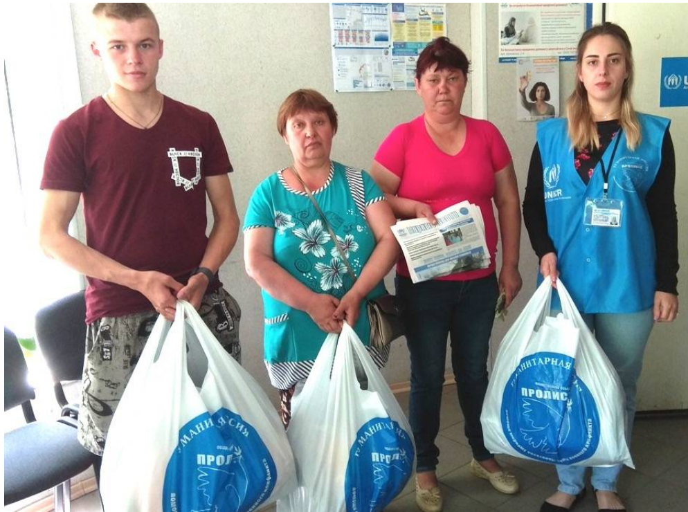
UNHCR and NGO partners have been supporting the villagers of Chyhari, one of the villages that has suffered the most from the escalation of violence in east Ukraine. In this photo, villagers have received solar chargers after the power supply had been cut because of hostilities.