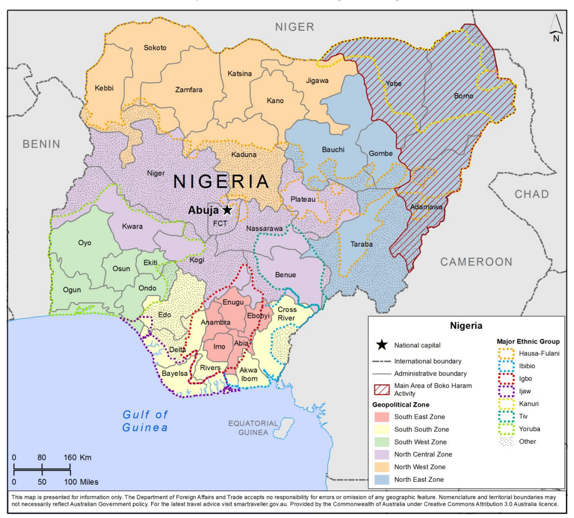
Map 2: @DFAT 20185