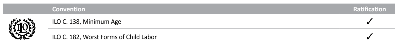
Table 3. Ratification of International Conventions on Child Labor

Maldives has ratified all key international conventions concerning child labor (Table 3).