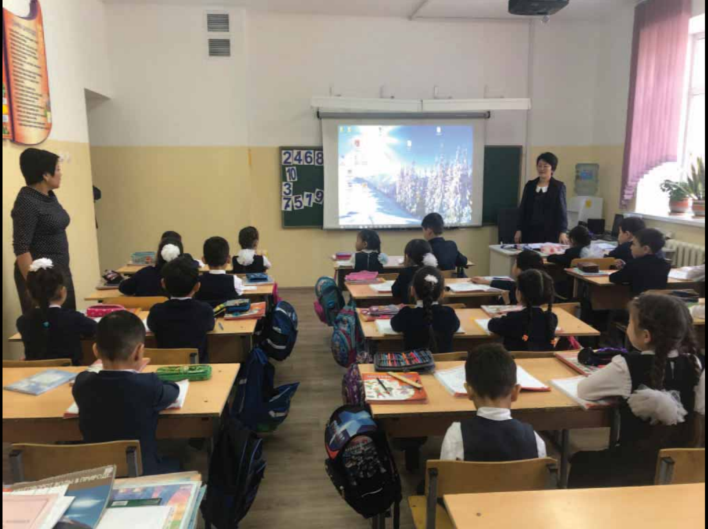
(above) First grade math class in a mainstream inclusive school in Almaty, Kazakhstan, includes at least one child with disabilities.