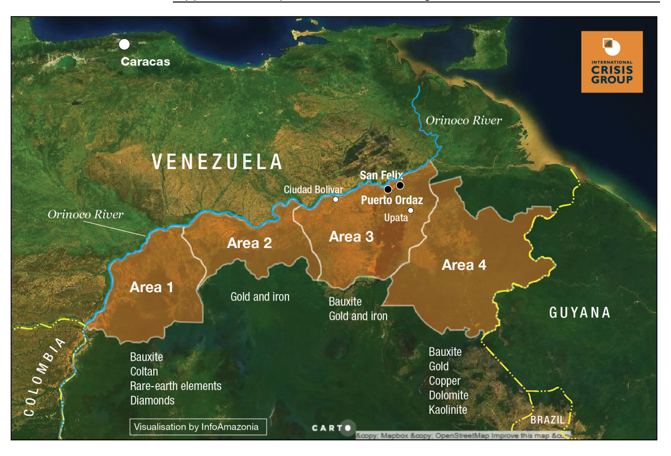
Appendix B: Map of the Orinoco Mining Arc