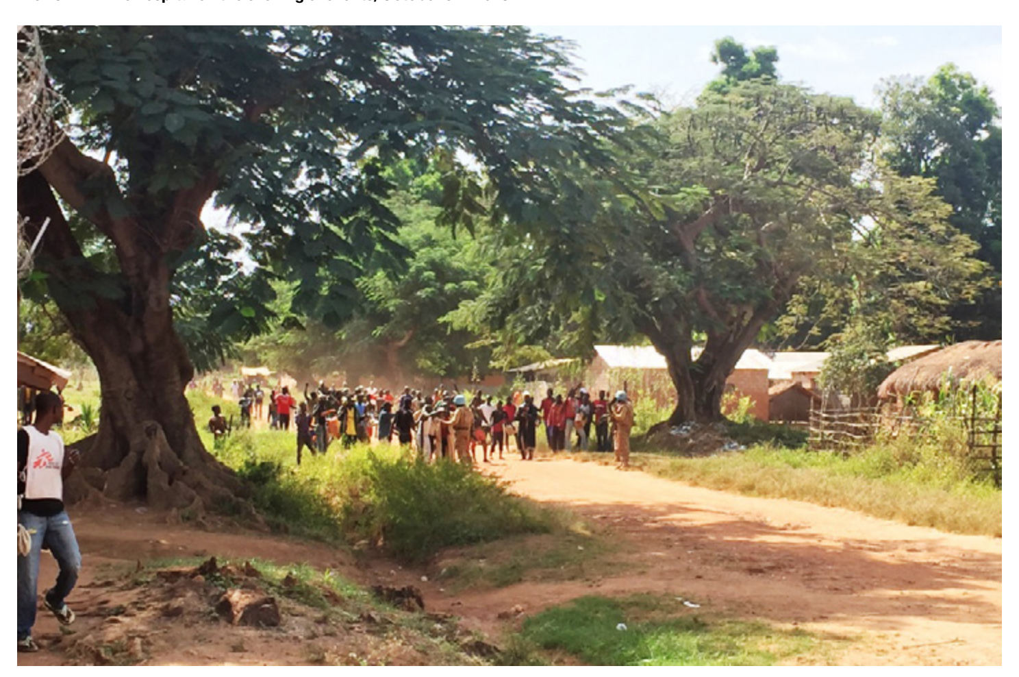
\label{eq:picture and bounds} \mbox{PICTURE 8. Demonstration against MINUSCA on November $4^{th}$, the very same day of the HC visit.}