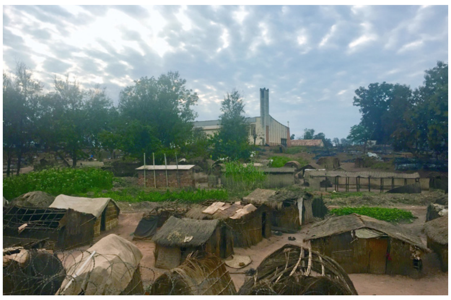
PICTURE 1. View of huts of displaced people that were not burnt, near the MSF's house.