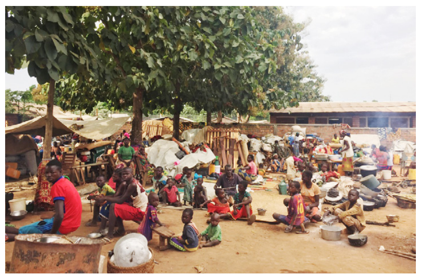
\label{eq:picture} \mbox{PICTURE 5. IDPs in the hospital in early November.}