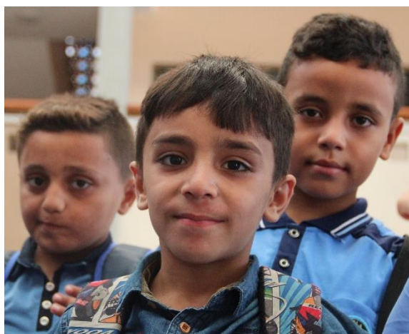
Children at UNICEF supported activities in Gaza