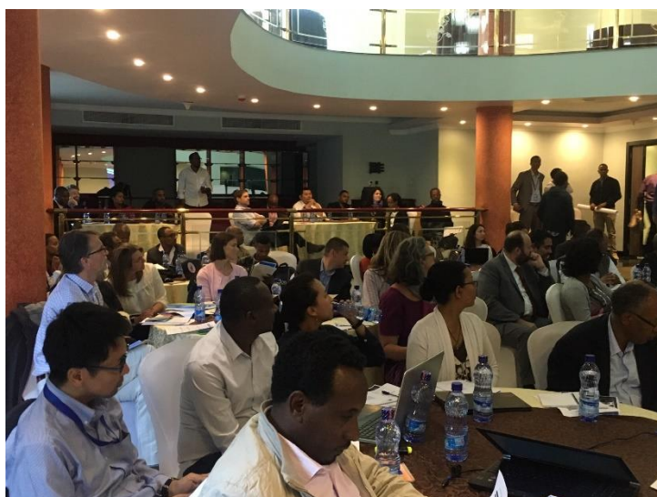
Figure 2 Government and partners discussing the 2019 HNO.

Partners also discussed multi-sector prioritized response plan in the 2019 HRP based on severity of needs and geographic priorities identified through the HNO analysis. Government and partners will launch the 2019 Ethiopia Humanitarian Response Plan by mid-February once the draft HRP is endorsed by the humanitarian country team and NDRMC.