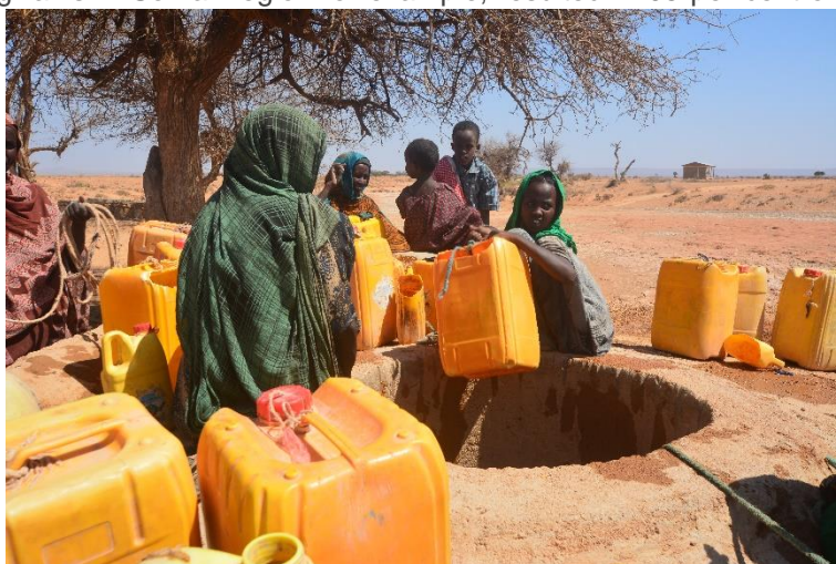
Figure 1 Water shortage at the height of the 2016 drought in Shebele zone, Somali region.