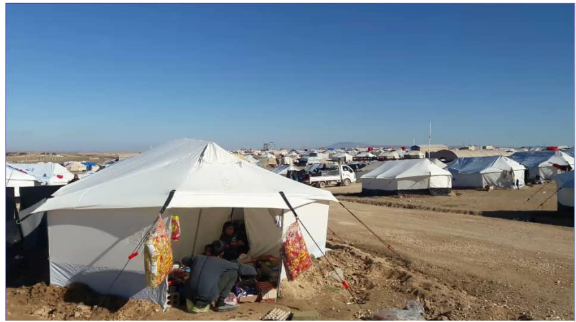
Shelters for newly arrived IDPs at Al Hole camp, Al Hasakeh, Feb. 2019.

camp's reception and communal areas. The situation has now improved as screening and registration processes have been accelerated in recent days. Currently, around 3,000 individuals are living in the camp's reception area and in communal spaces such as schools and communal kitchens, while large-size tents are being set up by the United Nations and other humanitarian organizations to host the new arrivals until they receive family tents. The United Nations and other humanitarian organizations