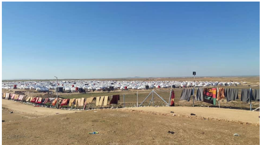
Al Hole IDP camp in Al Hasakeh Governorate, Feb. 2019.

Due to ongoing insecurity and proximity to areas of active conflict, humanitarian access to civilians in the Hajin area and to people on the move remains severely challenged. The UN and partners have not yet been able to provide assistance, including life-saving medical assistance to people who are sick or injured during their transit from Hajin areas to Al Hole camp. Humanitarian organizations are strongly advocating that people who are on the move are provided with the necessary assistance, in particular the