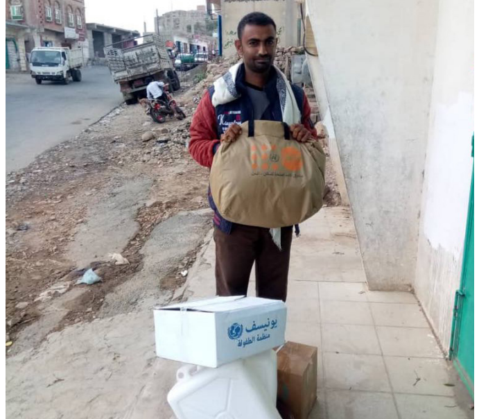
A displaced man from Hudaydah in Al Mahwit with his RRM kit.

A three-day polio vaccination campaign supported by WHO and UNICEF was launched in all four governorates in Al Hudaydah hub on 26 November targeting all children under age 5. Ahead of the campaign, UNICEF appealed for a cessation of hostilities in all active-conflict districts in Al Hudaydah Governorate: Ad Durahyimi, Bayt Al Faqiah, At Tuhayat, Al Kawkhah, Al Hays, Al Garrahi, Al Hali, Al Mina, Al Hawak and Zabid.