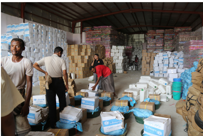
A Rapid Response Mechanism (RRM) distribution in Abs, Hajjah, coordinated by NRC.

Conflict however did not completely stop; sporadic fighting, shelling and bombardment continued to pose a threat to civilians in Al Hudaydah City and in other parts of the governorate. In Al Hudaydah City, clashes persisted in the east and northeast of the city, particularly around Al Saleh Residential Complex near 50 Street and Kilo 16.