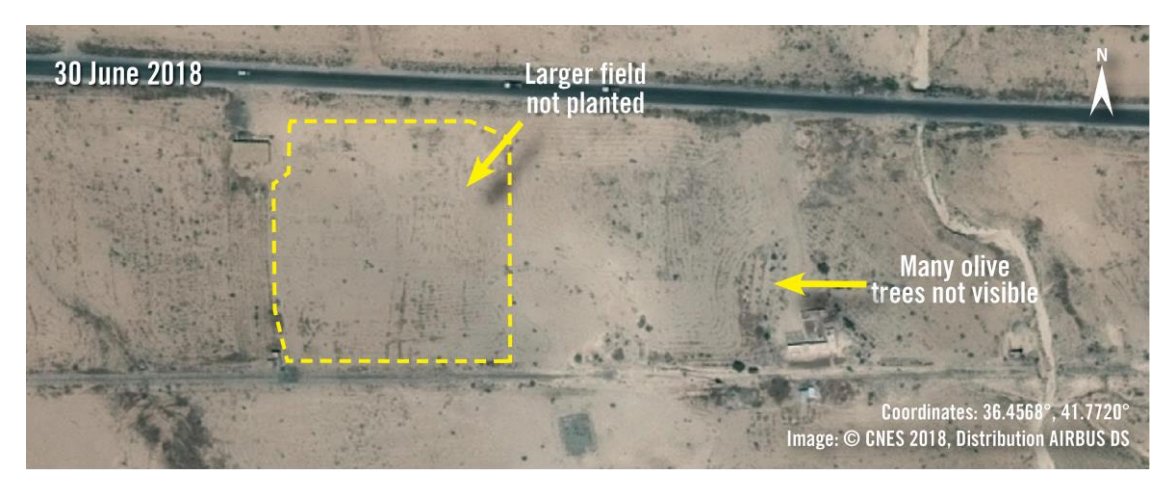
A farm north of Sinjar mountain is visible in imagery from 30 August 2014 and 30 June 2018. On 30 August 2014, after IS had taken over the area, crop lines are visible in fields around the farm. Though IS left this area in December 2014, on 30 June 2018, the entire area appears dry and there is no evidence of recent planting. Many of the olive trees are no longer visible.