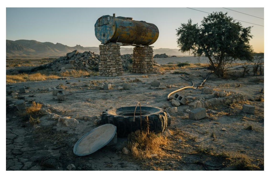
An empty water tank and a sabotaged irrigation well on an abandoned farm near Sinune town north of Sinjar mountain. A farmer from a neighbouring farm told Amnesty International that only five of the 10 families who used to live in the village pre-IS had returned.

Amnesty International visited an abandoned house in a small village just outside Sinune town to the north of Sinjar mountain. The nearby fields were barren. The entrance to the well was stained with oil, with oil stains also visible in and around ruptures in the black plastic irrigation pipe leading from the well. A large water tank near the well was empty and lengths of plastic irrigation pipes were nearby, broken and scattered. Another well on the same property was also destroyed, with rubble visible in the tube.