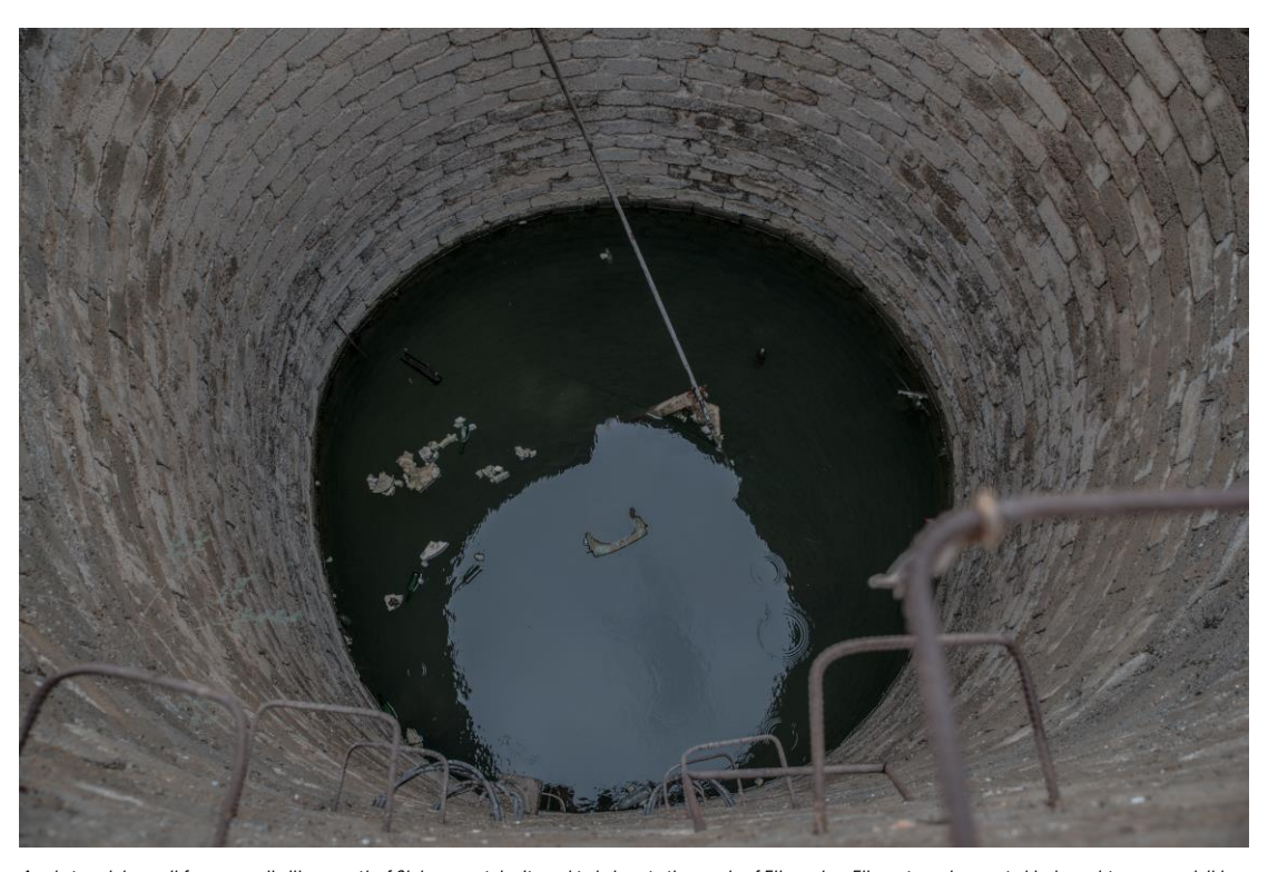
A sabotaged dug well from a small village south of Sinjar mountain. It used to belong to the cousin of Elias; when Elias returned concrete blocks and tyres were visible in the well.

When we left Sinjar [in August 2014] everything was ok and our water well was good. But when we liberated Sinjar and kicked out IS, we saw that all these wells were like this.