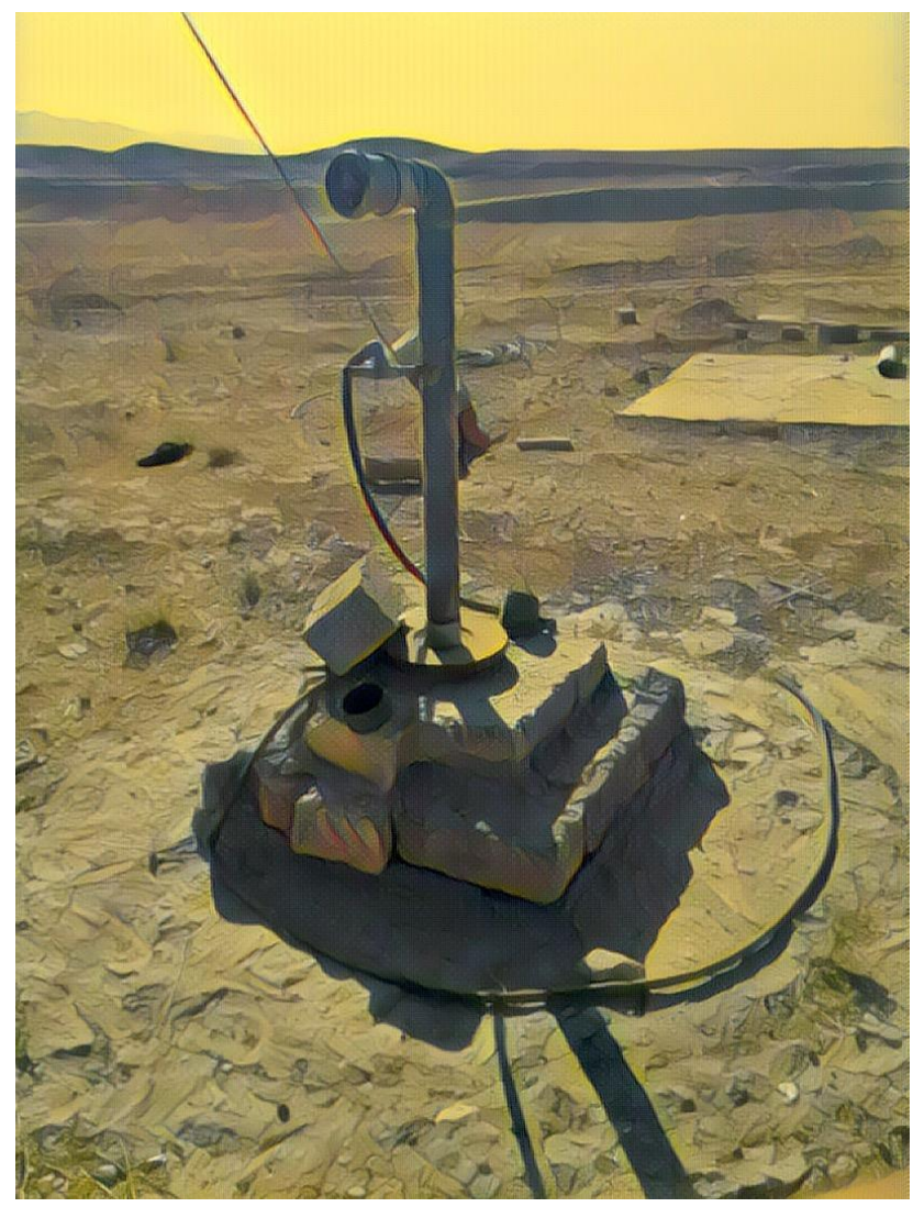
A typical irrigation well in Siniar district in northern Iraa's Ninewa governorate - hundreds of these were sabotaged by IS fighters.

Iraq has experienced severe droughts in recent decades, particularly in 1998-1999 and 2007-2008.35 It's gripped by one in 2018, so severe that the area under cultivation in 2018 is estimated by the Ministry of Agriculture at half what it was in 2017.<sup>36</sup> Over the long term, the situation is likely to deteriorate further. Scientific modelling of the effects of climate change on Iraq shows most regions of the country are likely to suffer a reduction in annual precipitation, especially by the end of the 21st century.<sup>37</sup>