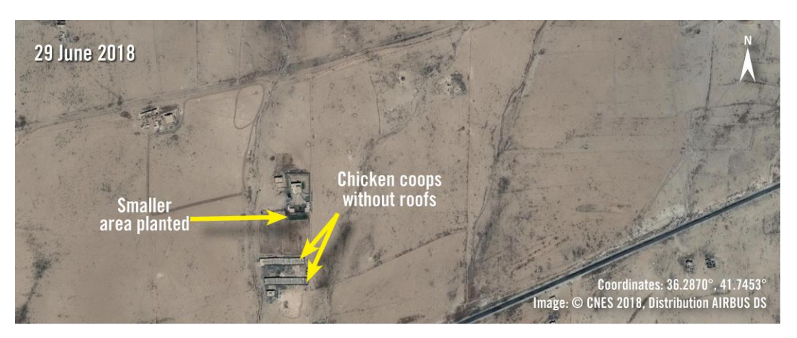
A farm approximately nine km west of Sinjar town can be seen in imagery from 31 August 2014, and 29 June 2018. On 31 August 2014, imagery shows the farm just after IS entered the area. Roofs are visible on the two chicken coops. The fields north of the chicken coops have crops visibly growing. In imagery from 29 June 2018, a small area of the field appears planted and the chicken coops are still without roofs.