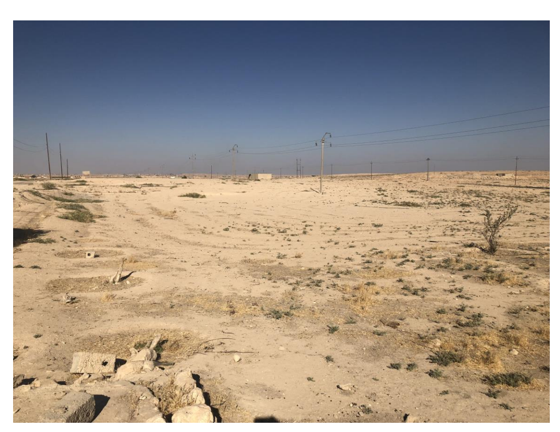
An abandoned farm just outside Sinune town north of Sinjar mountain. Before IS, farmers in the area grew olives, vegetables such as okra, tomatoes, onions, and cucumbers, as well as wheat.

To date, Iraq's government has not begun to meaningfully address the full scale of destruction of agricultural livelihoods or implement plans to assist farmers to rebuild Iraq's shattered land and the livelihoods it enables. As long as these areas lie in ruins, many hundreds of thousands of internally displaced people will be unable to return home. Even more will live in poverty. Given that some of these regions have been areas of discontent since 2003, there's a real limit to how far Iraq's recovery can sustainably progress without them.