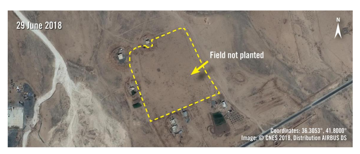
Imagery from 31 August 2014, 18 November 2015 and 29 June 2018, shows a farm approximately four km west of Sinjar. On 31 August 2014, IS had just entered the area. A pile of crop residue from a recent harvest is visible in the field. On 18 November 2015, imagery shows the field during the time when IS left the area. The lack of distinctive lines and a new road suggests the field had likely not been planted. On 29 June 2018, the field does not appear planted as typical in years before IS arrived.