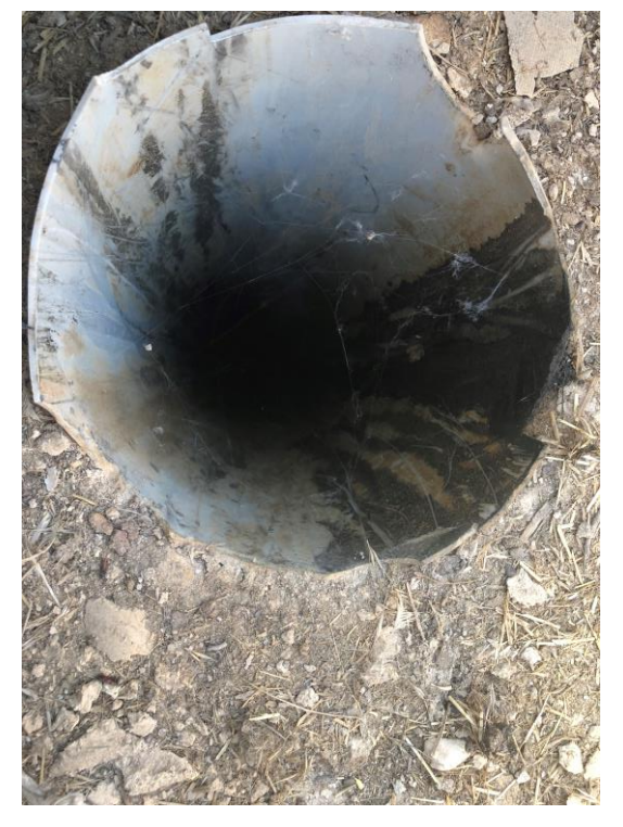
On the left: a sabotaged irrigation well on an abandoned farm just outside Sinune town north of Sinjar mountain. On the right: detail of a sabotaged irrigation well on an abandoned farm just outside Sinune town. The entrance to the well is stained with oil.