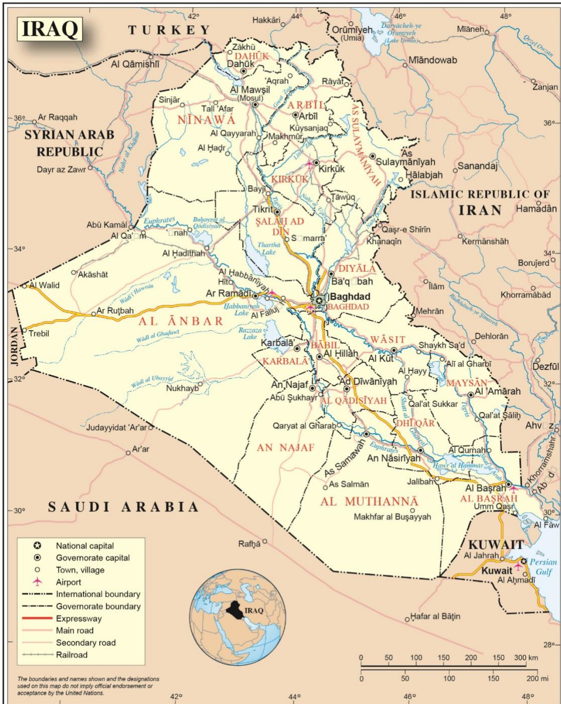
Map No. 3835 Rev. 6 UNITED NATIONS July 2014

Department of Field Support Cartographic Section