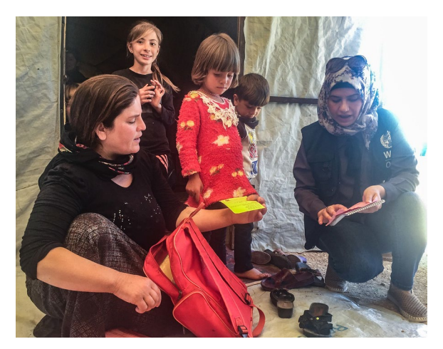
WHO provides support to a family in Mount Sinjar.

In Ninewa, humanitarian actors have reported to MOMD that nearly 30,000 tents in IDP camps need to be replaced, and nearly 9,000 outof-camp families are in need of shelter. In Salah al-Din, NGOs report that nearly 500 tents in the Al-Alam camps are in need of maintenance or replacement. However, some progress has been Kirkuk. Shelter/NFI made: in partners started distribution of