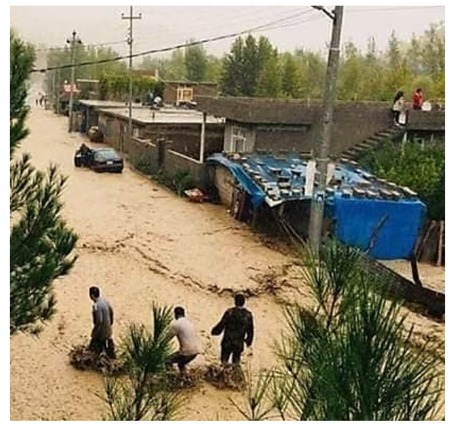
Flash floods in Rawandiz, KR-I.

The Iraqi Air Force worked to evacuate trapped people. Local authorities and humanitarian partners provided relief assistance to affected people including food, Non-Food Items