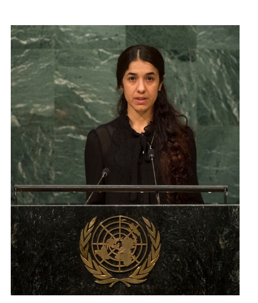
Nadia Murad speaking at the 2016 United Nations high-level summit on movements of refugees and migrants.

The prize was granted for their efforts to end the use of sexual violence as a weapon of war and armed conflict. Nadia Murad is a member of the Yazidi minority from Siniar in northern Iraq, and survived three months of brutal sexual assault perpetrated by ISIL. After three months, she managed to escape,