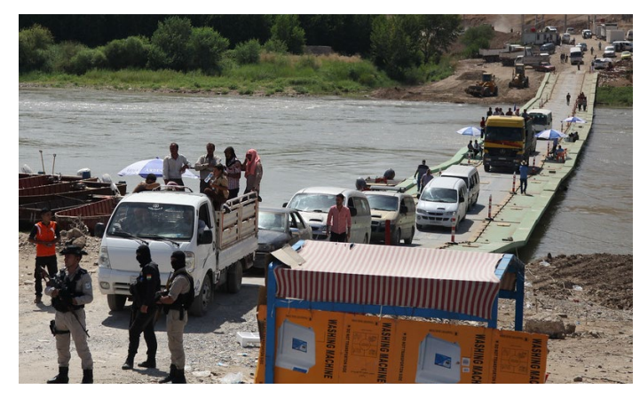
Lack of coordinated national policy on access hampers humanitarian activities.

The restrictions are primarily not exclusively being recorded at checkpoints between federal Iraq and the Kurdistan Region of Iraq (KR-I).