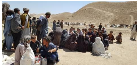
Families gather after a distribution of food by WFP in a displacement site close to Qala-e-Naw, Badghis.

Of the 2.2 million people most vulnerable and affected by the drought, humanitarian partners prioritised 1.9 million girls, boys, women and men for assistance from August until end of October. By beginning of October, some 1.2 million people had received some kind of humanitarian assistance, including more than 600,000 people who had received cash, food or livelihood support, according to the Food Security and Agriculture Cluster.