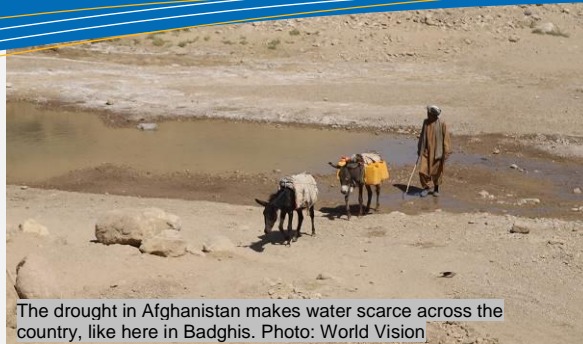
The drought in Afghanistan makes water scarce across the country, like here in Badghis.

http://fts.unocha.org by 18 October 2018