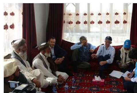
Mark Lowcock, Filippo Grandi and Toby Lanzer (right to left) interacting with elders from a community of displaced and returnee families.

At the end of their visit, they stressed that Afghanistan now more than ever needs the support of the international community , as it takes steps to pursue peace and stability, and to link humanitarian action to broader development efforts. They further called on donors to urgently increase and sustain support for the humanitarian response in Afghanistan, including to find durable solutions for millions of people caught up in the complex and rapidly evolving displacement crisis.