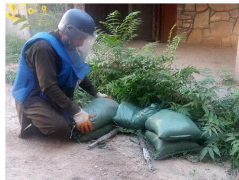
Mine action teams surveyed the city after the fighting and removed more than 100 explosive remnants of war and munitions.

Mine action teams, partners of the UN Mine Action Service (UNMAS), surveyed the city and surrounding villages and removed more than 100 explosive remnants of war and munitions. More than 8,000 residents, including girls and boys, participated in mine risk education sessions after the attack on Ghazni.