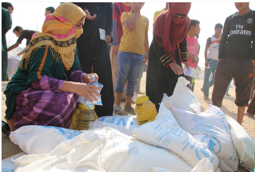
WFP food distributes in Debaga IDP camp.

The humanitarian community remains focused on working to ensure IDPs needs were met going forward.