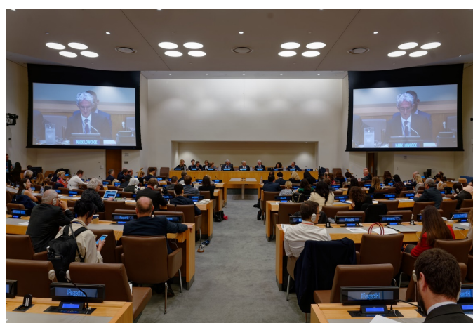
Civilians under fire: humanitarian protection and respect for International Humanitarian Law

The 73 rd session of the UN General Assembly opened on 18 September 2018. In its margins, OCHA organized a number of high level side events on issues of priority to the humanitarian community. Two events of particular significance to the Iraq context were “Safe and Respected: Preventing Sexual Exploitation, Abuse and Harassment in the Humanitarian Sector” and “Civilians Under Fire: Humanitarian Protection and Respect for International Humanitarian Law.”