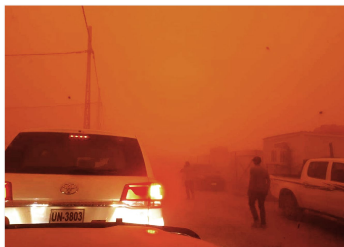
OCHA Humanitarian Financing Unit monitoring mission to Qayyarah.

Despite the overall scale of return (4 million IDPs as of September 2018), return rates appear to be levelling out: nearly half of all returns took place in 2017; just 18 per cent of IDPs have returned in 2018. More than 1.9 million IDPs remain displaced, of which over half have been displaced for more than three years. A significant majority of IDPs (71 per cent) reside outside of camps, mostly within the Kurdistan Region and Ninewa. While humanitarians are able to reach approximately 94 per cent of in-camp IDPs, they are reaching only 10 per cent of people outside of camp settings.