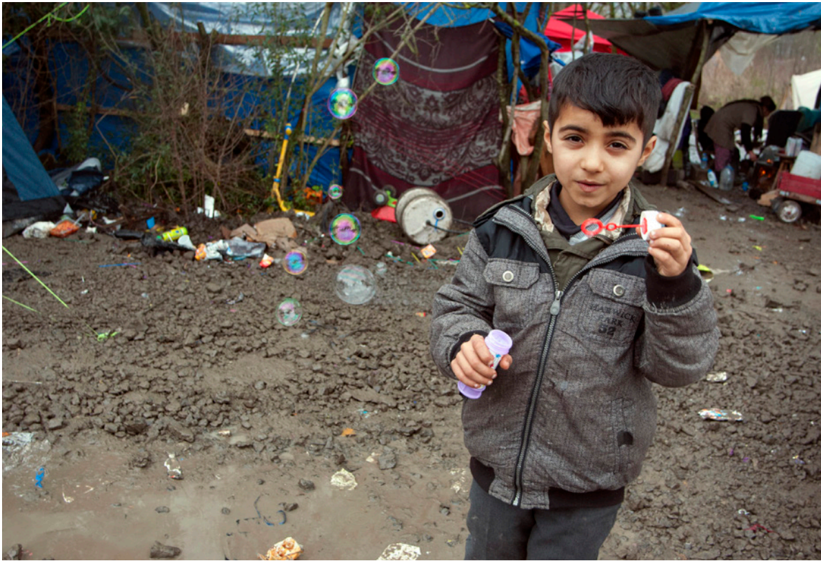
A boy blows bubbles in a camp near Dunkirk, France, populated mainly by Kurdish asylum seekers.

on securitization, with hundreds of millions of dollars channelled to the Sudanese government to contain migration flows out of the country. As a result, the situation for thousands of asylum seekers and migrants has dramatically deteriorated, with many facing arrest, torture and deportation.