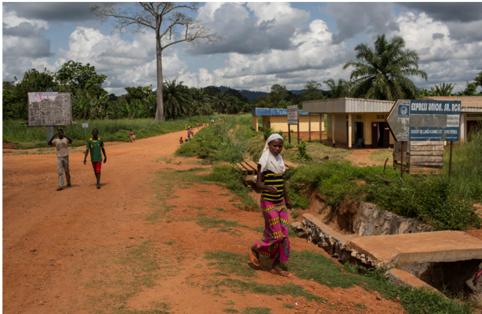
A Muslim girl walks down a street in Nola town, CAR. Will Baxter.