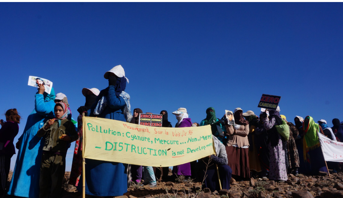
Members of the Amazigh community take part in a peaceful protest against the Imider silver mine in Morocco. Linda Fouad.

Amazigh have long faced marginalization in Morocco. The village lacks basic infrastructure such as schools and hospitals, and if Amazigh children want to continue their studies beyond primary education they have to travel miles to do so. Yet on their doorstep is the Imider silver mine, owned by Société Nationale d'Investissement (SNI), a private holding company belonging to the Moroccan royal family. The mine is the most productive in Africa, a fact that