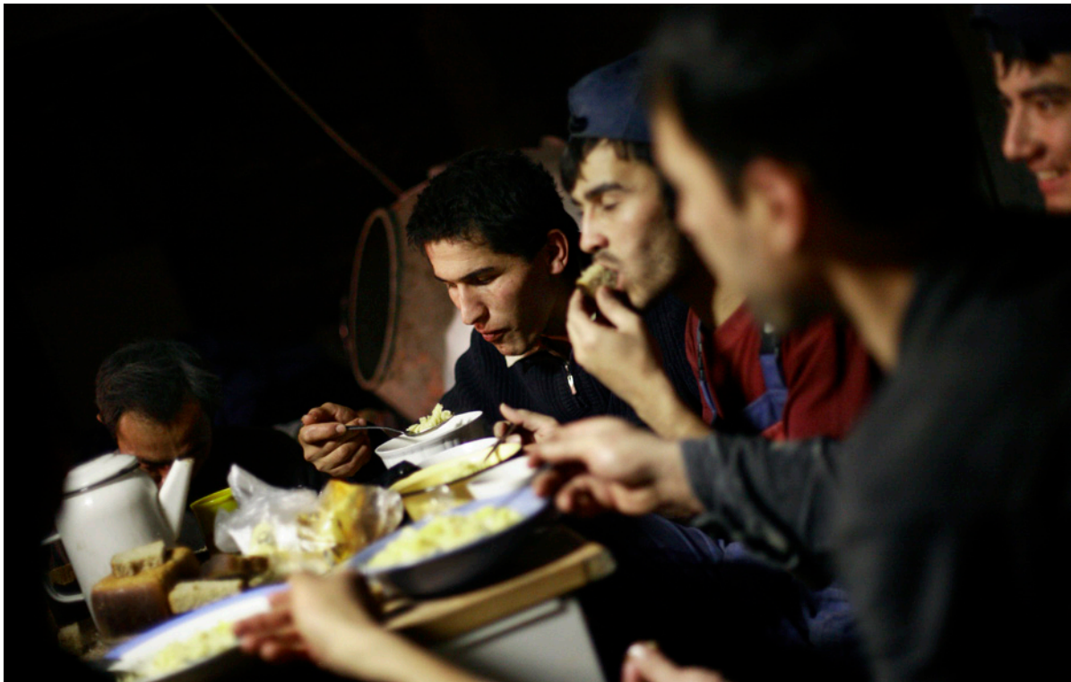
Migrant workers from Uzbekistan eat in their temporary living quarters on a construction site in Moscow, Russia.