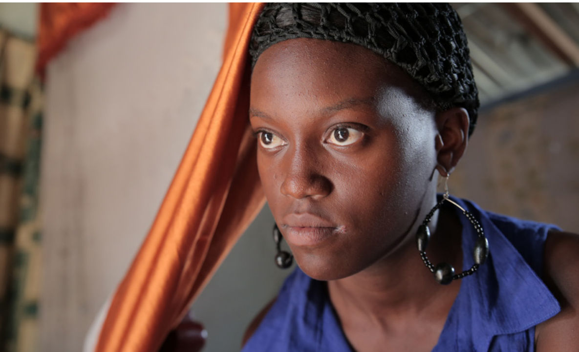
A still from Minority Rights Group International's film about Dominicans of Haitian descent living with statelessness in the Dominican Republic.

This judgment has paved the way for the mass deportation of many Dominicans of Haitian descent and Haitian immigrants to Haiti, as well as exacerbating the already entrenched discrimination experienced by these individuals. Despite some steps to resolve the situation, including the passage of a highly flawed Naturalization Law in May 2014, thousands of Dominicans of Haitian descent have yet to regularize their status. Besides effectively rendering them stateless, this has left many at risk of deportation to Haiti – a country some have never even visited. The legislation has been condemned by, among others, the Inter-American Commission on Human Rights (IACHR), which has highlighted