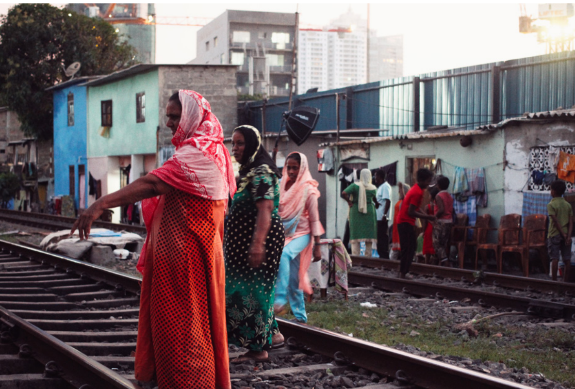
A small Malay community with no permanent housing lives by the rail tracks, drawn by the proximity of Slave Island, Sri Lanka.