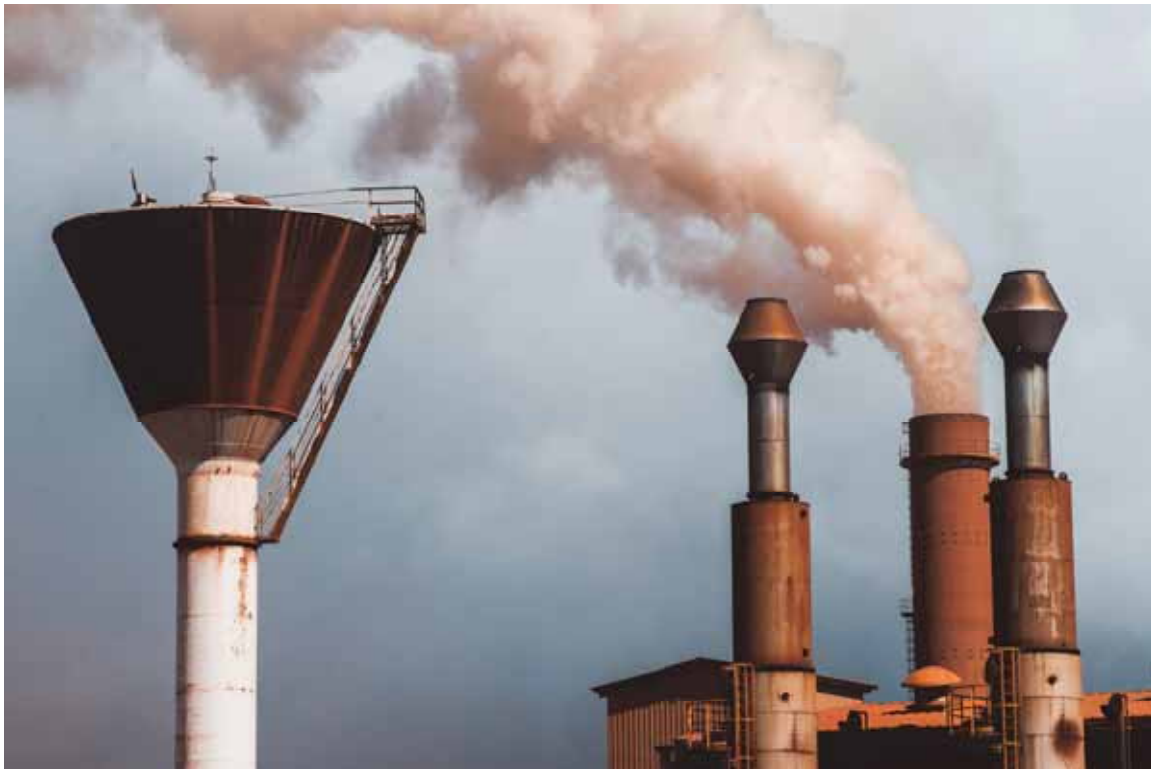
A chimney emits smoke at a bauxite treatment plant operated by Compagnie des Bauxites de Guinee (CBG) in Kamsar, Guinea, on September 7, 2015. Local leaders have long expressed concerns about the impacts of the emissions on local air quality.

emissions produced by CBG’s operations, including in residential areas, both at current production levels and as production increases during the expansion project. 375