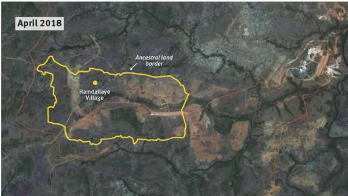
Two satellite images, one from May 2002 and another from April 2018, show how the mining operations of La Compagnie des Bauxites de Guinée (CBG) have encroached onto the ancestral lands of Hamdallaye village. The ancestral lands are marked with a yellow border.