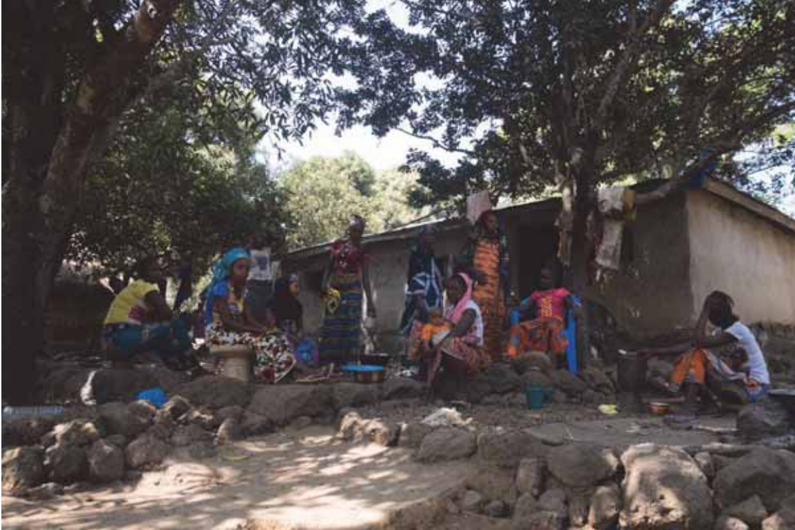
Women prepare food in Hamdallaye village in the Boké region. Compensation payments for land lost to mining are often paid to male heads of household or linages, even where the land is utilized by entire families or households.

A widow said compensation for her household’s land was awarded to her husband’s family, denying her the revenue she used to support her children. “I used to grow rice and maize in the land where the port is now,” she explained. 193 “Because the compensation was paid after my husband died, it was his family who participated in the census that SMB conducted, and they are the ones who received the money from the company. I know who’s got the money, but I can’t go and claim it.” Female elders said this had happened to several other widows in the same village. 194