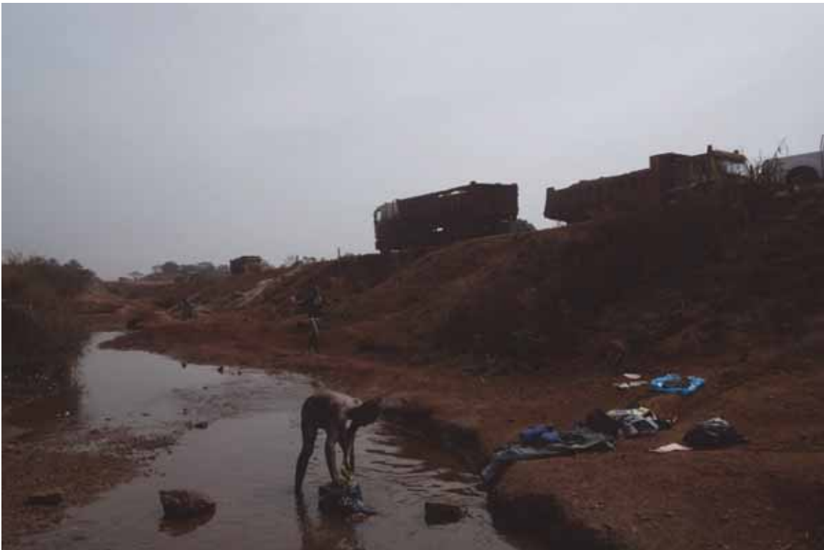
A man washes clothes next to a mining road belonging to the La Société Minière de Boké (SMB) consortium. Local communities state that the construction of SMB's mining roads blocked rivers and streams, diverting their course and reducing water levels in local wells.

Mining companies underscore that there are multiple reasons for inadequate access to water in the Boké region, including population migration, climate change-related factors and the aridity of the area, particularly in the dry season. They say they take steps to mitigate the impact of mining on local water sources and highlight their work to build boreholes and wells in mining-affected communities. The absence of public government or company data regarding the impact of mining on water levels and quality, however, makes it difficult to assess the adequacy of companies' responses.