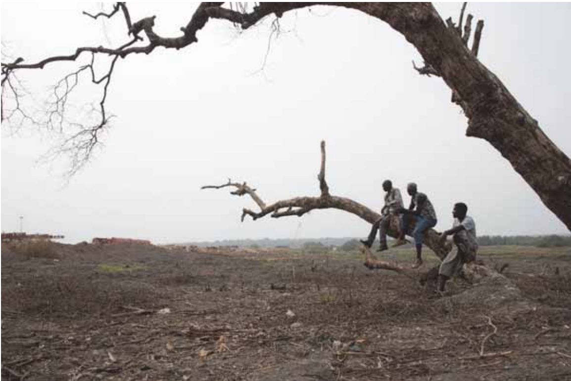
Farmers from Dapilon village, in the Boké region, look out over land, on the banks of the River Nunez, cleared for the construction of a mining port belonging to the La Société Minière de Boké consortium. © January 2018. Ricci Shryock for Human Rights Watch.

to improve your house, but now that your farmland has gone you still have to put food on the table.”