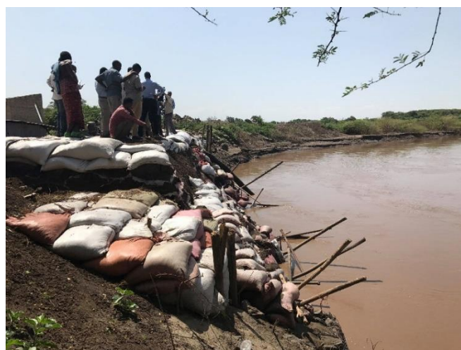
Figure 2 Retention wall with sand-filled sacks

The Awash Basin Flood Taskforce led by the NDRMC Commissioner visited flood preparedness activities in Afar region from 20-27 September 2018. On 26 September 2018, the task force witnessed first-hand the release of water from Koka and Tendaho dams. Water released from the dams caused no damage to communities due to flood mitigation activities were done before. These include a construction of a 12-kilometer canal in Illu woreda of the upper Awash basin, maintenance of 48 km dike in the middle Awash basin in Amibara woreda and the construction of an 800-meter diversion in the lower Awash basin in Dubti woreda.