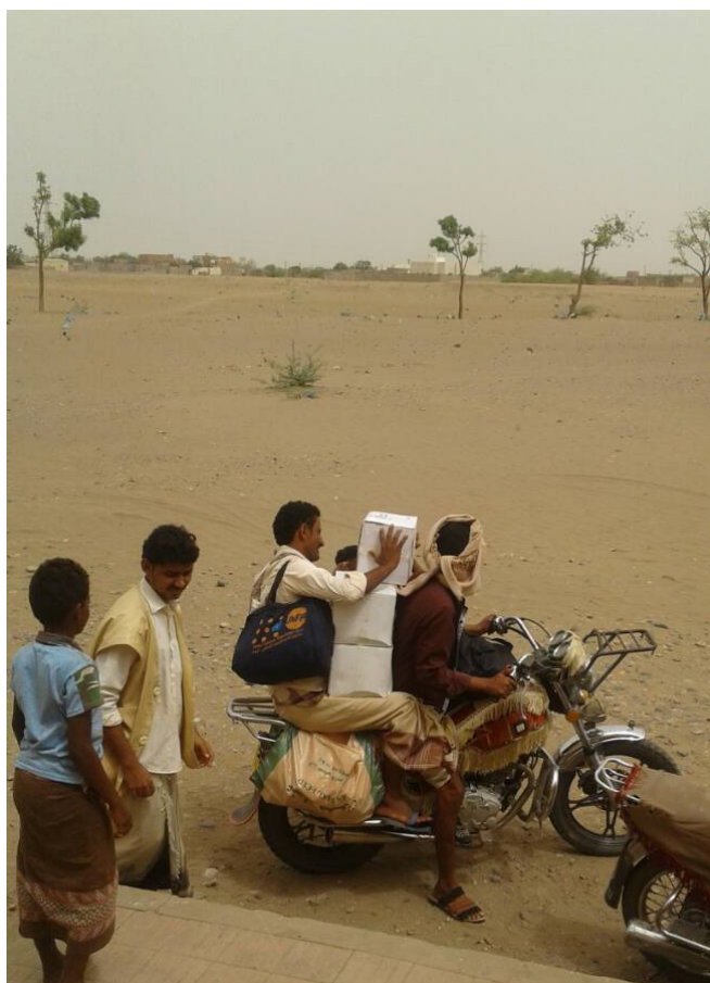
IDPs return home after receiving rapid response transit kits in Al Hudaydah.

Fighting continues in Al Hudaydah City, albeit at a less severe scale, as a general decrease in clashes, bombardments and airstrikes has been reported. Casualties are reported but actual numbers are unknown. During the last two days, large scale displacement from Al Hudaydah City has been observed, civilians are using their own vehicles or renting public transportation to move out of the city towards neighboring districts east and northwards. Humanitarian partners report that some IDPs from Al Hudaydah City have arrived in the capital, Sana'a. Total figures on displacement are not available yet as humanitarian organisations are working on verifying the IDPS.