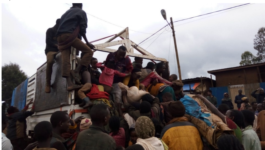
Figure 1 IDP returnees being transported to their place of origin in Kercha woreda (West Guji zone).

Requirement for the Gedeo-West Guji conflict IDPs assistance for six months.