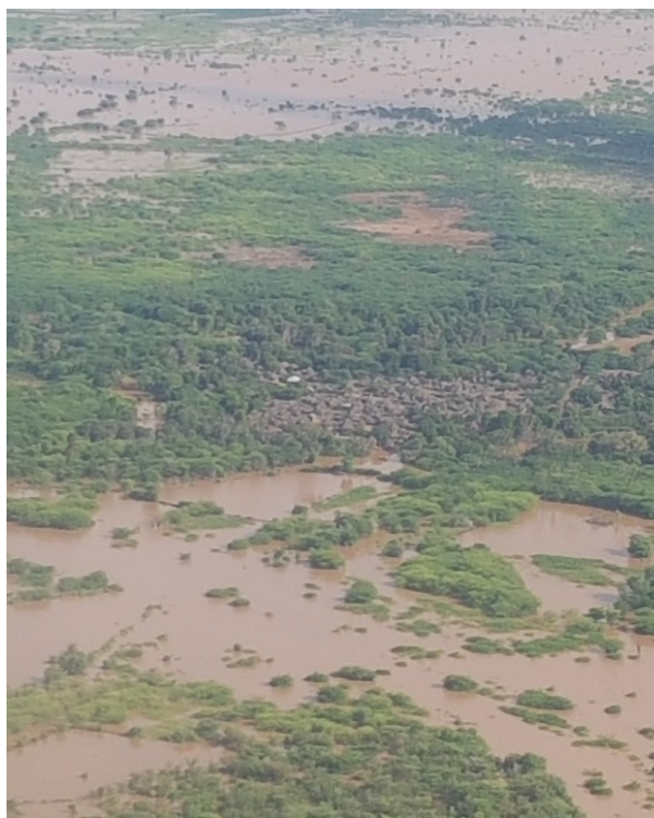
Figure 2 Flooded areas in Somali region.

The National Flood Taskforce is finalizing a flood emergency plan that will address the needs of an estimated 713,304 people likely to be affected by floods, of whom 179,229 will likely be displaced across the country until November. Due to heavy rains, Ethiopia's main river basins, Upper and Lower Awash, Tekeze, Lake Tana, Baro River, Omo, and the Koka Dam reached full capacity and dams were opened to discharge excess water. Communities around major river basins are therefore at heightened risk of flooding and require close monitoring and repositioning of relief items.