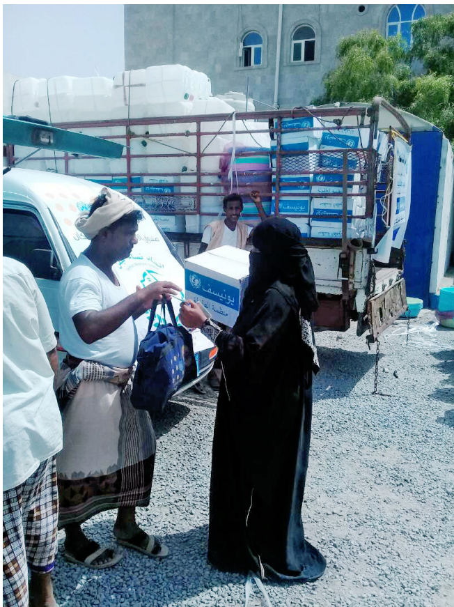
Distribution of RRM kits, Credit: OCHA

Al Hudaydah port is operational and accessible. As of 24 June, three commercial vessels were at berth in the port, five were in the anchorage area and one UNVIM-cleared vessel was en route.