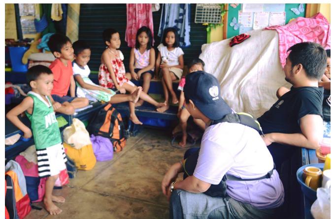
Sto, Domingo, Albay (29 January 2018) - OCHA staff chat with children evacuated to Brgy. Salvacion National High School, which served as one of the evacuation centres.

Local governments are also interested in improving people's access to information as part of their response planning. The HCT's Community Engagement Community of Practice, led by OCHA, can share existing mechanisms and tools to improve communication with and feedback from people affected by disasters to meaningfully engage them in the response to and recovery from disasters.