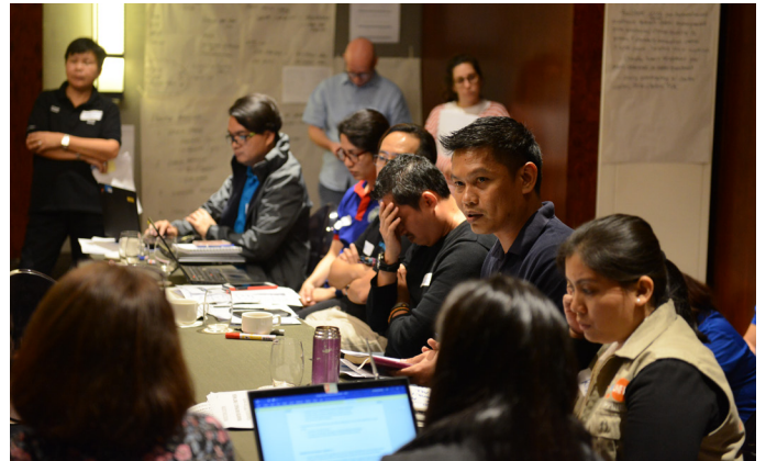
Credit: OCHA/J. Manipol Makati City (8 March 2018) - Cluster members discuss how they will address the immediate needs of survivors of a 7.2-magnitude earthquake.

On 8 March, the results of these planning efforts were assessed in a day-long simulation exercise of the HCT, its clusters and working groups. With representatives from key Government partners and international donors participating as role players and observers, the exercise participants tested their activation, inter-cluster coordination, prioritization and public communication procedures over the first several days following a 7.2-magnitude earthquake. The next day, an after-action review resulted in an action plan that aims to address ten key areas for improvement.