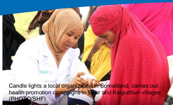
Candle lights a local organization in Somaliland, carries out health promotion campaigns in Baar and Kalgudhun villages