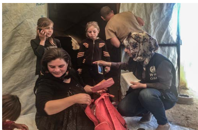
A joint UN assessment mission, comprising OCHA, UNHCR, UNICEF and WHO, assessing response gaps following the recent floods in Mount Sinjar, Ninewa.

The IHF has just completed this year's first standard allocation of $34 million. This allocation is supporting 83 projects through 53 international and national humanitarian partners to implement priority activities under the HRP. Approximately $25 million (75 per cent) of this allocation is funding non-UN partners, including $3.3 million (9 per cent) that are directly allocated to national NGOs. An additional $800,000 (2 per cent of the total allocation) is sub-granted to national NGO partners of UN agencies and international NGOs. The allocation has a geographical focus with Ninewa, Anbar and Kirkuk governorates receiving the bulk of the funds to respond to the humanitarian needs of Iraq's most severely affected communities.