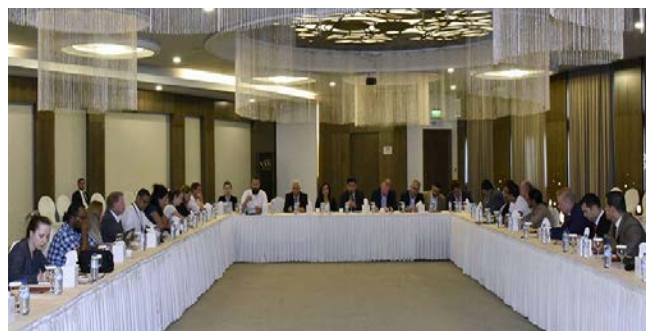
Representatives from the government, JCC, UN agencies and cluster coordinators meet in Erbil to discuss the progress and gaps in humanitarian response in Iraq.