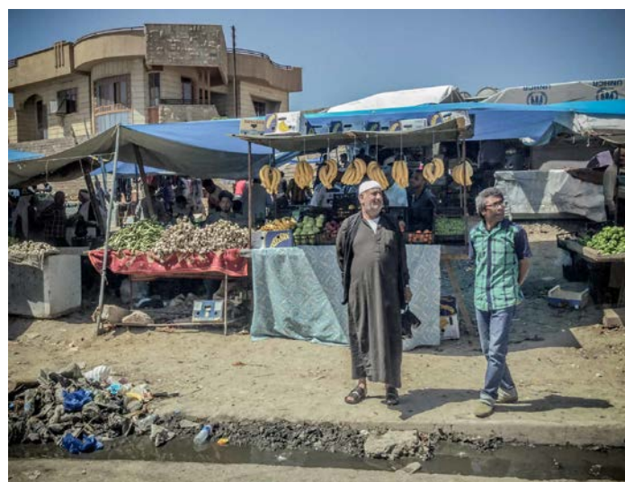
Street markets reopen in Mosul's east side - the least damaged part.

The Iraq Internally Displaced Persons Call Centre indicates that many displaced people reported a reluctance to return home due to the limited provision of services and livelihood opportunities as well as insecurity in the areas of origin. These factors may have contributed to a slowing down of the pace of returns in recent months.