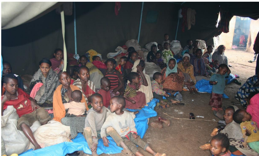
Figure 1 IDPs at TVT site of Gedeb woreda want to return home soon if peace and security is guaranteed.

Requirement for the Gedeo-West Guji conflict IDPs assistance for six months.