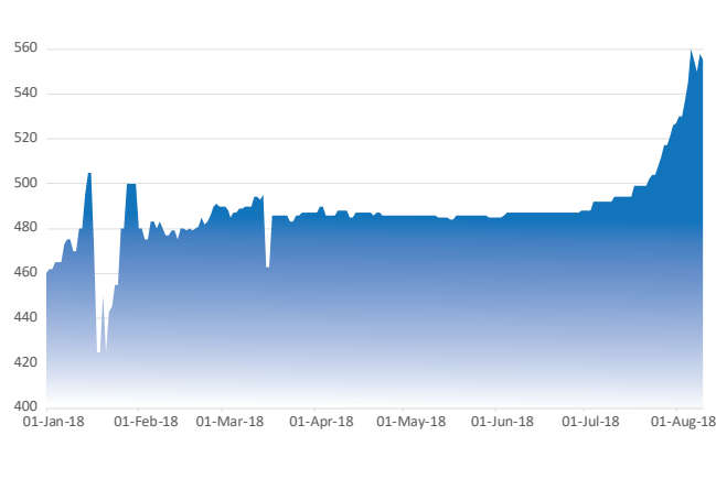
Exchange Rate History - Yemen Riel to US Dollar Sana'a City Buying Rate

In July, the YHF allocated approximately $7.4 million under the Second Reserve Allocation for priority gaps in Al Hudaydah including emergency allowances, civil documentation and cash assistance to IDP site management and coordination, emergency reproductive health services and mine action. Since January 2018, the YHF has received $122 million from 22 generous donors.