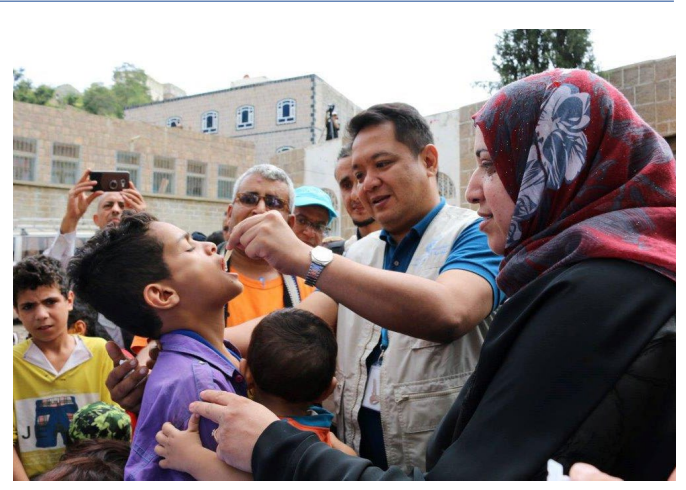
The vaccination aims to protect against cholera.

A nationwide polio immunization campaign was also launched to immunize 5.5 million children under the age of 5 years. Yemen has been polio free since 2006, but children remain vulnerable especially due to the current conflict which has devastated the healthcare system. Both campaigns are implemented by WHO and UNICEF, with support from the World Bank.