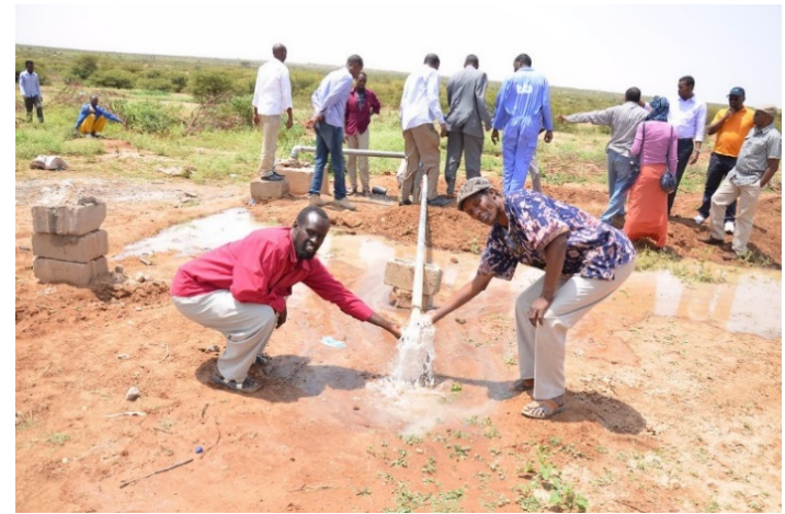
It is cost effective to drill boreholes than truck water.

Four consecutive poor rainy seasons had pushed the country to the verge of famine last year. The collaborative efforts of aid agencies and authorities, alongside timely and historic levels of support from donors. staved off famine. Relief from the drought came in the form of above average Gu rains. The were not rains without negative impacts as severe flooding resulted in scores of deaths and affected over 830,000 people through crop asset loses and temporary displacement.