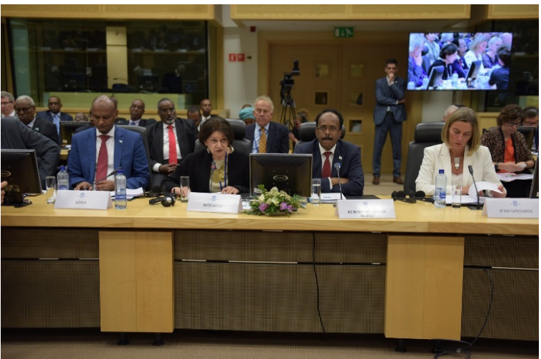
The forum was attended by the President of Somalia, Mr. Mohamed Abdullahi Mohamed 'Farmaajo' and representatives from 58 countries and six international organizations.

Representatives 58 countries and six international organizations met in Brussels on 16 and 17 July for the second Somalia Partnership Forum (SPF). inaugural SPF was held Mogadishu in December 2017. Hosted the by European Union and Sweden, the latest meeting discussed Somalia's politics, security and economy. International partners commended