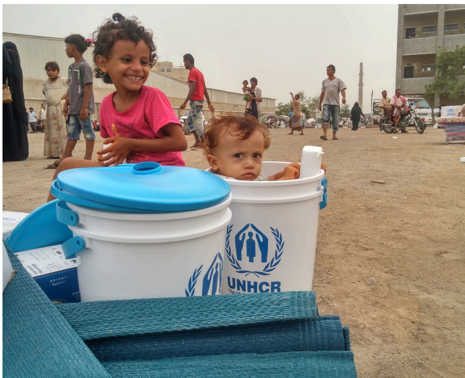
As UNHCR's partner carries out distributions of core relief items in Hudaydah city, two displaced Yemeni children find some enjoyment after being forced to flee their homes.

While displacement of families is ongoing, UNHCR and its partners are working together to reach a verifiable figure of displacement. The protection of civilians is being increasingly threatened in Al Hudaydah by indiscriminate attacks by the warring factions. According to the latest UNHCR-led Protection Cluster Civilian Impact Monitoring Report, almost 50 per cent of civilian casualties in Al Hudaydah to date have occurred when people were in their own homes or farms, and 25 per cent when they were on the road, many of them trying to access services or find routes to safety. The six-month report also highlighted that a total of 844 incidents caused over 1,800 civilian casualties, 26 per cent of which were women and children. Furthermore, 85 per cent of the incidents resulted in psychosocial trauma implications for the people affected. UNHCR continues to remind all parties to the conflict to ensure the protection of civilians and guarantee their access to humanitarian assistance.