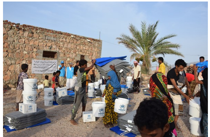
Mekkunu cyclone affected population receiving NFIs kits provided by UNHCR in Socotra.

These distributions provided the families with the essential lifesaving assistance to alleviate their suffering and enabled them to access essential NFIs. EESKs were distributed by IOM to 500 families affected by Mekkunu Cyclone in Socotra and NRC assisted 230 IDP and host community families in Al Qabbaytah district (Lahj). The distributions targeted the most vulnerable newly displaced families. Cash for rental subsidies provided by UNHCR through INTERSOS to 143 IDP families and 4 host community families in Dar Sad, Ash Shaikh Outhman, Al Mansura, Craiter, Khur Maksar, Attawahi, Al Mualla and Al Buraiqeh districts (Aden) also 105 IDP families and one host community family assisted in Tuban, Al Hawtah, Al Qabbaytah and Al Maqatirah (Lahj). Additionally, SHS assisted 153 IDP families and 47 host community families in Ataq district (Shabwah). The cash grants provided hope to displaced families who are facing eviction after falling behind with accumulated rent. Al Tawasul Foundation provided rehabilitation grants for 47 IDP families whose houses were damaged in Al Mualla district and 9 families in Khur Maksar district (Aden) also Estijabah Network assisted 236 families in Tuban district (Lahj). This assistance allowed these families to rehabilitate parts of their own houses and restart their lives in some dignity.