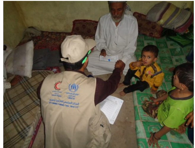
An IDP family who have recently displaced from Al Hudaydah is being assessed by YRCS team in Amran.

Al Hudaydah hub: UNHCR through JAAHD (Jeel Albena Association for Humanitarian Development) completed the distribution of NFIs to 4,772 Internally displaced families and EESKs (Enhanced Emergency Shelter Kits) to 1,476 families in different districts in Al Hudaydah governorate during the reporting period. ACF (Action contra La Faim) assisted 140 families with NFIs in Al Hudaydah governorate. These assistance were provided to most vulnerable families who displaced without any personal belongings ensuring that they could live with their families with some dignity in temporary shelters that offers a secure and healthy living environment.