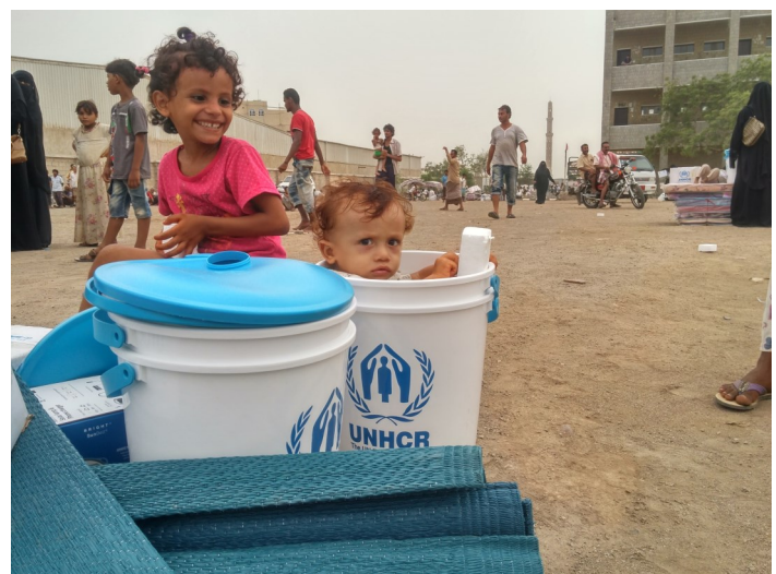
IDP children feeling happy with the NFIs provided to their family in Al Hudaydah City.