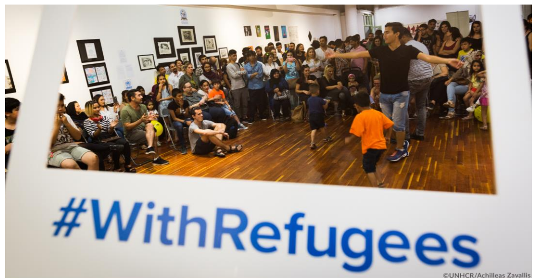
Refugee communities, UNHCR and partner organisations commemorated World Refugee Day in a festival in Technopolis of the Athens Municipality on 20 June.