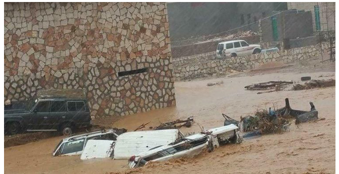
Flooding in Socotra during Cyclone Mekunu.

In order to respond to the needs created by the impact of cyclone “Mekunu” humanitarian partners are dispatching a consignment of emergency supplies to Hadibo including 10.5 Mt of food supplies, emergency medical supplies, 1,000 shelter/NFI kits, 4,000 hygiene kits, 35 water bladders and supplies of chlorine to purify water. A UN team is scheduled to fly to Socotra on 29 May to work with the local authorities in further assessing needs and coordinating response efforts. OCHA Flash Update on cyclone “Mekunu” can be found here: https://reliefweb.int/report/yemen/yemen-cyclone-mekunu-flash-update-2-27-may-2018