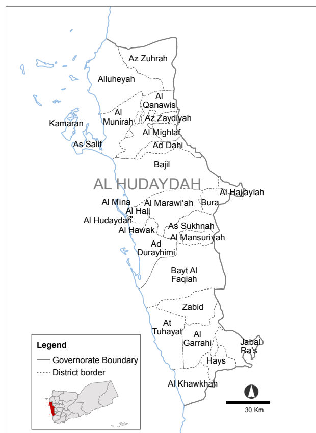
Al Hudaydah governorate

As far as the situation in Taizz Governorate is concerned, armed clashes have reportedly intensified in the eastern parts of Taizz City and in the western front in Maqbanah and Al-Ma'afir Districts. The Ibb Health Sub-Cluster is supporting three frontline hospitals (Al-Barh and Hajdah Hospitals in Maqbanah District and Aoon Hospital in Sharaab Al-Salam District) with medical supplies to prepare for the possible casualties from areas affected by violence. The shift in frontlines in western Taizz has, however, opened humanitarian access to Al Wazi'iah and Mawza Districts from the cities of Al Turba and Aden.