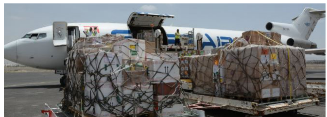
WHO supplies. Credit WHO Yemen

Sana’a: Four civilians were reportedly killed and nine others injured by airstrikes that struck the Yemen Petroleum Company’s main petrol station in Sana’a City, on 26 May. Women and children are understood to have been among the casualties. In Marib governorate, the health office confirmed that five civilians were killed and 22 others sustained injuries in an explosion at a local market in the densely populated Al Mujama’a area in Marib City on 22 May. Meanwhile, two WHO-chartered planes carrying over 21 MT of essential medicines arrived in Sana’a airport during the reporting period. The supplies include trauma kits for 3,200 patients requiring surgical care, medicines to treat some non-communicable diseases and cholera. A UNICEF plane delivered life-saving vaccines for over six million children.