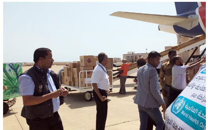
Relief flight in Socotra.

The situation in Al Mahara Governorate, which was also hit by Cyclone “Mekunu” appears to have stabilised although some areas are still flooded. Agricultural equipment and warehouses were damaged in Al Ghaydah. ICRC reports 20 persons injured and four dead (two in Hawf and two in Al Ghaydah). The roads in and between Hadramaut and Al Maharah Governorates are reportedly partly damaged or blocked by floods, rocks or quicksand.