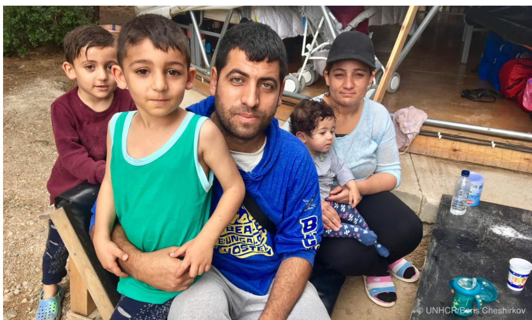
A Syrian Kurdish family from Kobani at the volunteer-run centre of PIKPA in Lesvos.

1 Islands Unit in Athens 1 Sub Office on Lesvos 3 Field Offices on Chios, Samos, Kos 2 Field Units on Leros and Rhodes