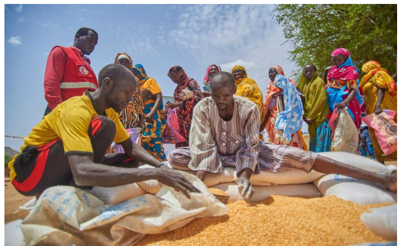
Lowcock attended a WFP food distribution while in South Kordofan (May 2018)