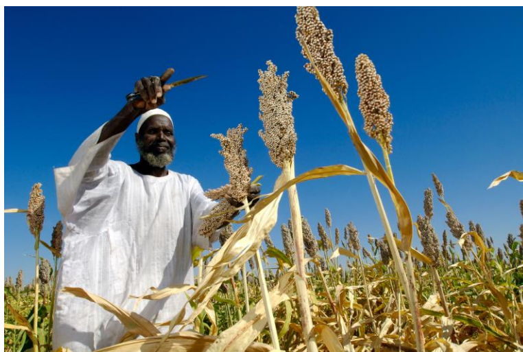
A farmer harvesting sorghum in Sudan (archive, UN)

According to the latest Global Information and Early Warning System (GIEWS) Food Price Monitoring and Analysis (FPMA) Bulletin , in the capital, Khartoum, prices of wheat increased in April by more than 10 per cent after a 20 per cent decline in March. Overall, cereal prices in April were more than twice year-on levels and at record or near-record highs after sharp increases in late 2017 and early 2018, following the removal of wheat subsidies in the 2018 budget (FPMA Food Policies) and the strong depreciation of the local currency. The removal of subsidies of electricity, coupled with limited availability of fuel across the country, and resulting higher prices of transport contributed to the increase in food prices. Localized production shortfalls affecting the 2017 harvest provided