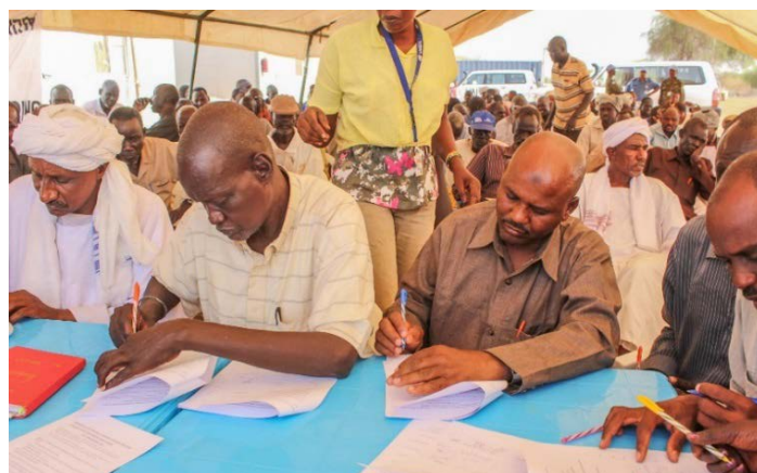
The signing of the community peace agreement

To resolve a conflict involving access to pasture and water, representatives from the Ngok Dinka and Misseriya communities signed on 5 March a community peace agreement in the Abyei Administrative Area. The signing took place during a three-day migration conference, held in the Abyei Area – the third of its kind – under the auspices of the International Organization for Migration (IOM) and the UN Food and Agriculture Organization (FAO).