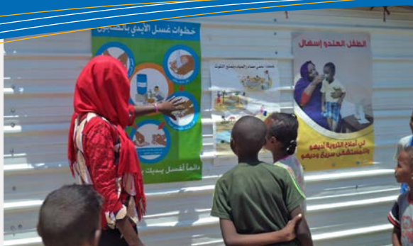
Children being shown the steps of hand washing with soap (UNICEF, 2016)