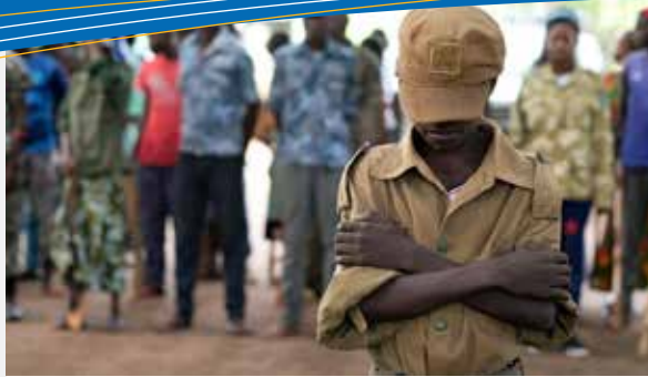
A 13-year-old boy stands during a ceremony to release children from the ranks of armed groups in Yambio. See story on page 2.