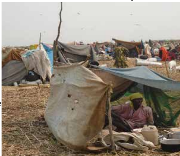
IDPs in Makak swamp.

Food security is expected to deteriorate through at least July 2018, as widespread insecurity continues to displace communities. Nearly 4.3 million people – one in three South Sudanese – have been displaced, including more than 1.76 million who are internally displaced and about 2.5 million in neighbouring countries.