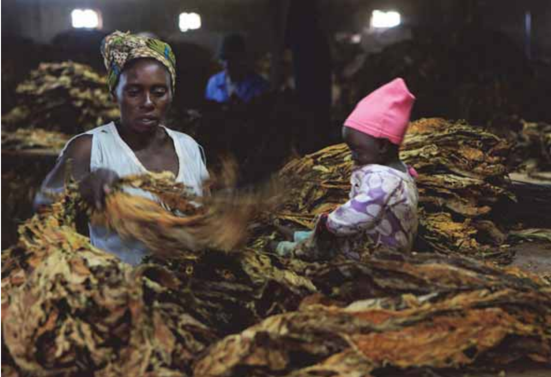
A woman sorts dried tobacco leaves in Harare, Zimbabwe while a child sits nearby.

Northern Tobacco (NT), the company with the second-largest market share of tobacco purchases in Zimbabwe in 2016, included information on the hazards to children of exposure to dust while working in tobacco farming in its 2017 Grower’s Guide on Child Labour in Tobacco Farming. In a section outlining hazards in agriculture, the document states, “Children who work in tobacco production are exposed to dust when preparing the land, weeding, harvesting, curing, grading and transporting tobacco leaves. Respiratory, skin and eye problems such as allergies and asthma, are common reactions.” 81