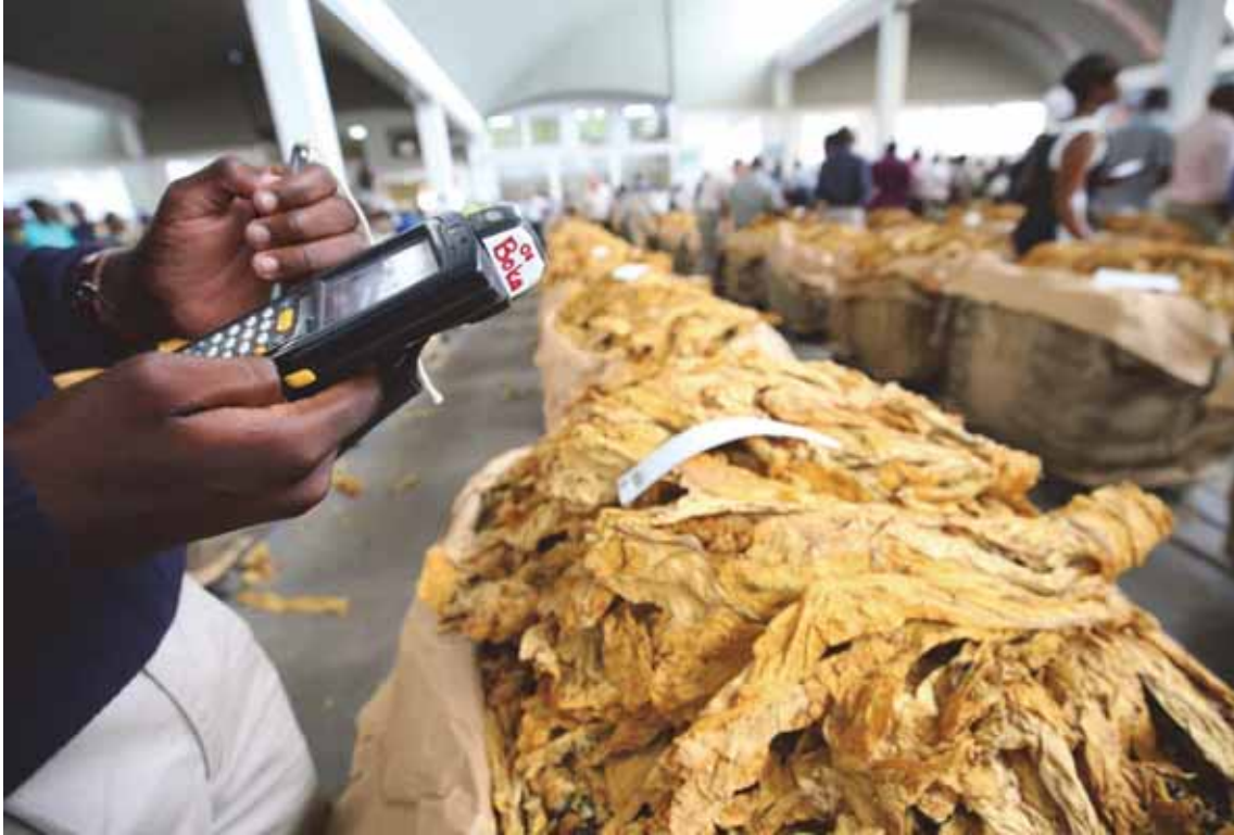
A buyer logs data on the first day of the 2017 tobacco selling season in Harare, Zimbabwe.

best results for all parties involved.” BAT and Imperial stated that they would work to encourage increased transparency within STP. 270