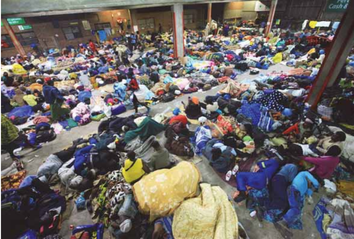
Tobacco farmers sleep in an auction house in Harare, Zimbabwe waiting to sell their tobacco crop to buyers.

Human Rights Watch wrote to 31 tobacco companies, including the eight companies that accounted for 86 percent of the tobacco purchase market share in Zimbabwe in 2016. We also wrote to several companies with whom we had previously corresponded regarding child labor on tobacco farms in other countries. The companies included 12 multinational tobacco companies: Altria Group, Alliance One International (AOI), British American Tobacco (BAT), China National Tobacco Corporation, Intercontinental Leaf Tobacco (ILT), Contraf Nicotex Tobacco GmbH (CNT), Imperial Tobacco (Imperial), Japan Tobacco International (JTI), Rift Valley Corporation/Northern Tobacco (NT), Premium Tobacco Group (Premium)/Premium Tobacco Zimbabwe (PTZ), Philip Morris International (PMI) and Universal Corporation (Universal); and three Zimbabwean tobacco leaf merchant companies: Boostafrica Traders (Boostafrica), Chidziva Tobacco Processors (Chidziva), and Curverid Tobacco Limited (Curverid). We did not contact other Zimbabwean companies with smaller market shares.