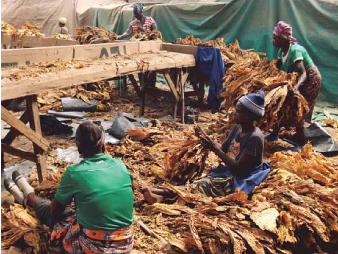
Workers sort dried tobacco leaves on a farm outside of Harare, Zimbabwe.