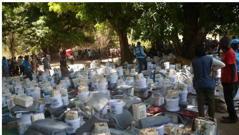
Distribution of non-food items to refugees and IDPs near Lasu, outside Yei town