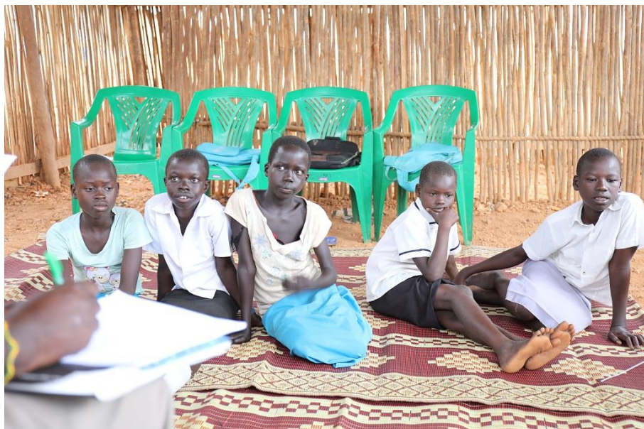
Participatory assessment with IDP girls at POC 3