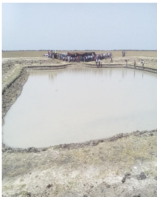
UNHCR and HDC constructed a 2,000 sq.m. water reservoir (hafir) in Jonglei State with funding from the European Union