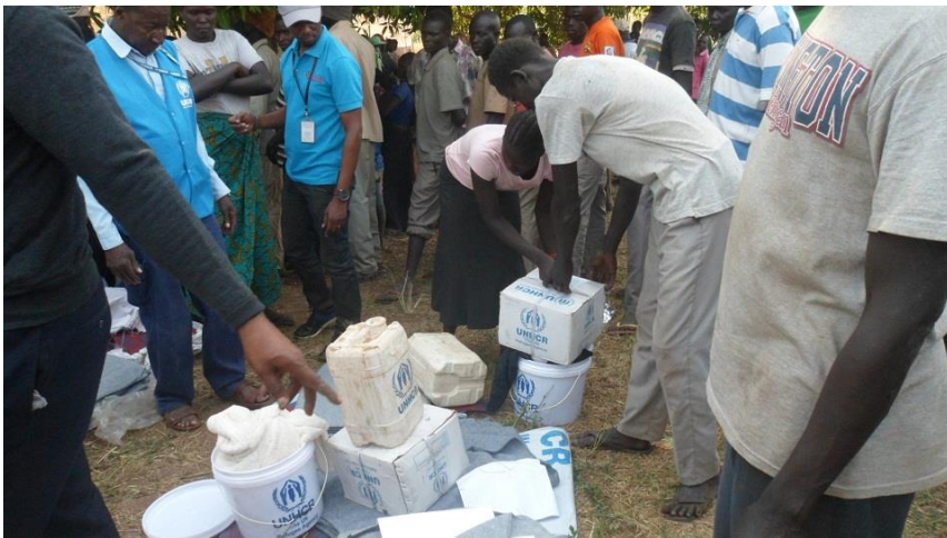
Distribution of non-food items to refugees in Lasu refugee settlement