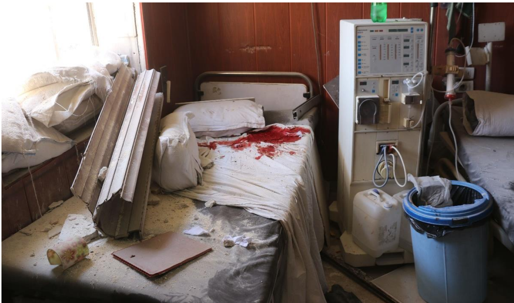
Omar bin Abdaziz hospital in the Maadi district of Aleppo after a barrel bomb attack by government forces. The hospital has been attacked seven times since the start of the conflict.

Attacks occurred most frequently in areas under opposition control. Eastern Ghouta, northern Hama, and southern Idlib were particularly affected, with 31 out of the 38 attacks, or roughly 81 percent, occurring in these regions. PHR also confirmed incidents in Aleppo, Damascus city, Deir Ezzor, and Homs.