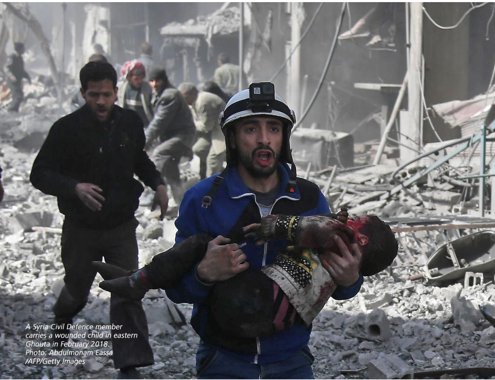
A Syria Civil Defence member carries a wounded child in eastern Ghouta in February 2018.