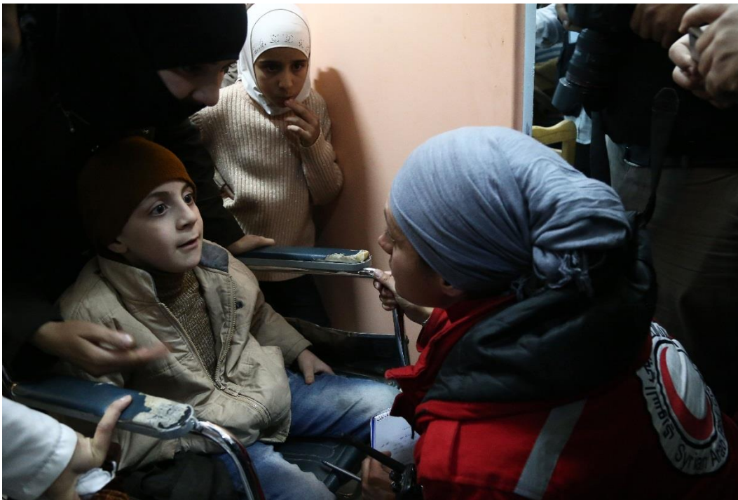
A member of the Syrian Arab Red Crescent talked to a boy in a hospital in besieged eastern Ghouta, where government denial of humanitarian supplies has caused widespread suffering. Doctors there said they saw dozens of malnourished children every day.

Since the beginning of the Syrian conflict in March 2011, civilians have been deliberately targeted by all parties to the conflict, in direct violation of international humanitarian law. One significant aspect of the Syrian government's strategy to crush its opposition has been the systematic assault on civilian health, through bombing and shelling of health care facilities, killing of medical personnel, besiegement of civilian populations, and deliberate blocking or limiting of aid delivery to civilians, including the repeated stripping of medical supplies from humanitarian convoys. These modes of attacks on health, taken together, generate a lethal context in which civilians suffer and die not only from the direct consequences of military warfare, but also from the indirect but not less intentional denial of adequate medical care and, over time, from malnutrition and starvation.