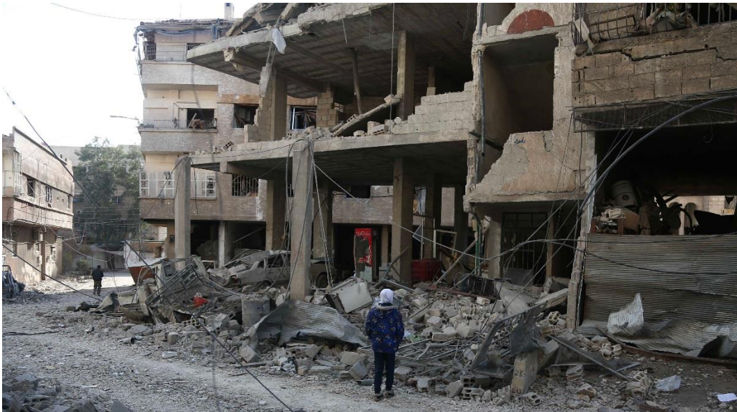
A girl looks at the rubble of a hospital that was destroyed in a reported government strike in eastern Ghouta in February 2018.

On March 2, 2018, the UN Human Rights Council in Geneva held an emergency debate on the situation in eastern Ghouta and elsewhere in Syria. While some Council members wondered aloud what the Human Rights Council might possibly achieve where the Security Council's binding resolutions had failed, 12 the Council adopted a resolution at the end of the debate asking the Independent International Commission of Inquiry on Syria to conduct an investigation of the events in eastern Ghouta and to report on it at the Human Rights Council session in June. 13 At the debate, UN High Commissioner for Human Rights Zeid Ra'ad al-Hussein called for a referral of the situation to the International Criminal Court, noting: "What we are seeing, in eastern Ghouta and elsewhere in Syria, are likely war crimes, and potentially crimes against humanity. Civilians are being pounded into submission or death." 14