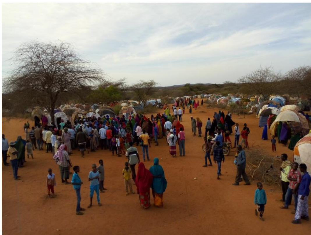
Figure 1 Close to 8,000 household IDPs reside at El-ma'an IDP site, Hudet woreda , Dawa Zone

From 7 to 16 February 2018, UNOCHA led a mission to assess the situation of new influxes of IDPs (displaced between December 2017 and January 2018) in El-ma'an IDP site, Hudet woreda /district in Dawa zone, Somali region. The assessment identified close to 8,000 El-ma'an displaced households, majority women and children, requiring urgent food, water, health, shelter and sustainable livelihood support. Critical shortage of ES/NFIs coupled with overcrowded IDPs in this new IDP site is posing huge protection concerns. The zonal administration called for Government and humanitarian partners to pay particular attention to IDPs with specific needs (older persons at risk, unaccompanied and separated children, persons with disabilities and pregnant and lactating women). Partners are looking into mobilizing additional resources to address the rising IDPs needs.