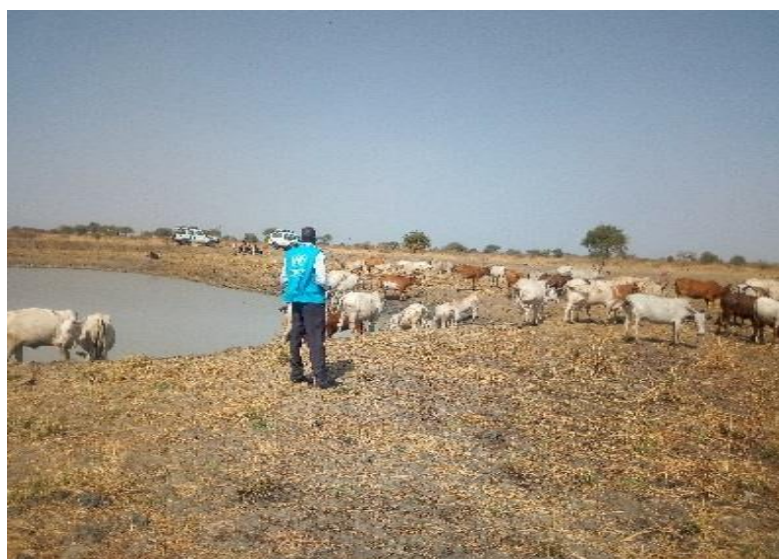
UNHCR staff in Baidit Jonglei inspects a Hafir while cattle drink water. A hafir well reserves water for cattle especially during dry season.