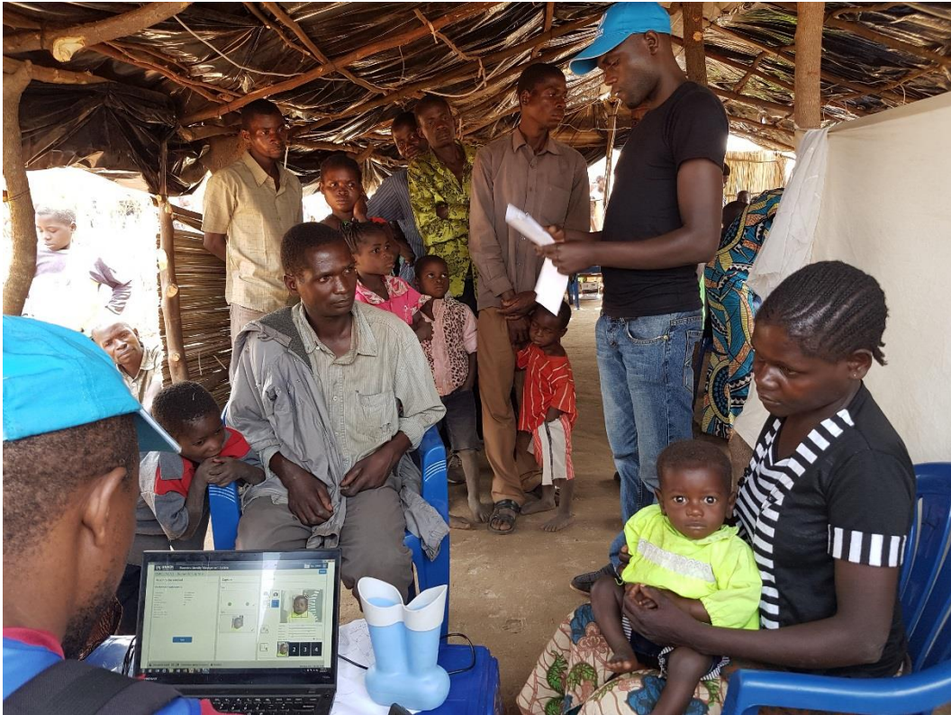
Biometric registration is allowing systematic information gathering as well as planning of humanitarian response activities for Congolese refugees hosted at Kenani Transit Centre.