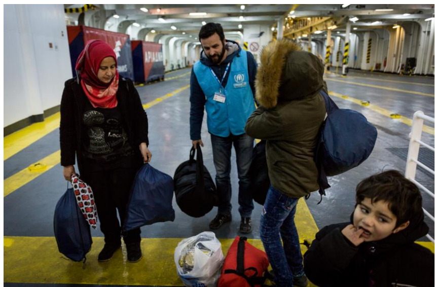
Syrian refugee carries her bags as she prepares to board the ferry from Lesvos © UNHCR/Achilleas Zavallis.

1 Islands Unit in Athens 1 Sub Office on Lesvos 5 Field Offices on Chios, Samos, Kos, Leros and Rhodes